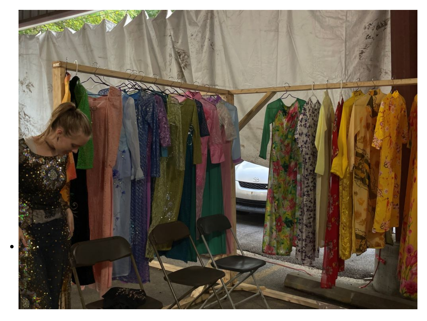
Shops selling traditional "ao dai" dresses were popular. (Peter Tran)