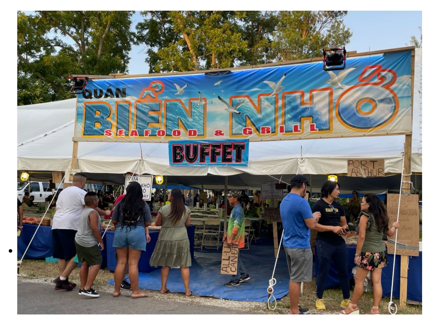
Vietnamese and American food booths catered to the hungry crowds. (Peter Tran)