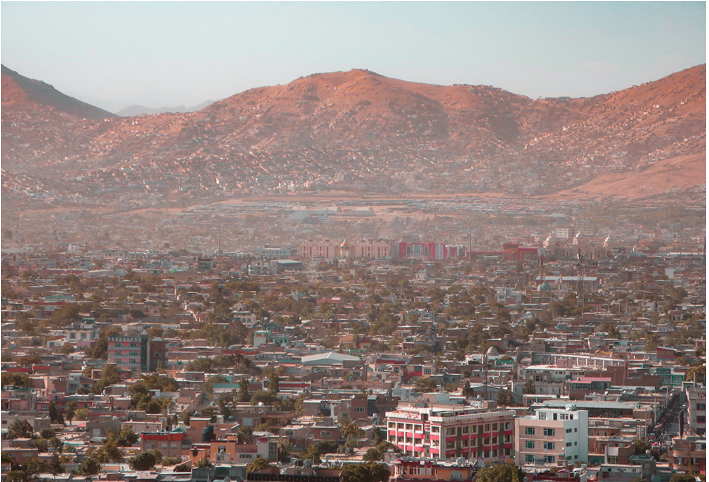
Kabul