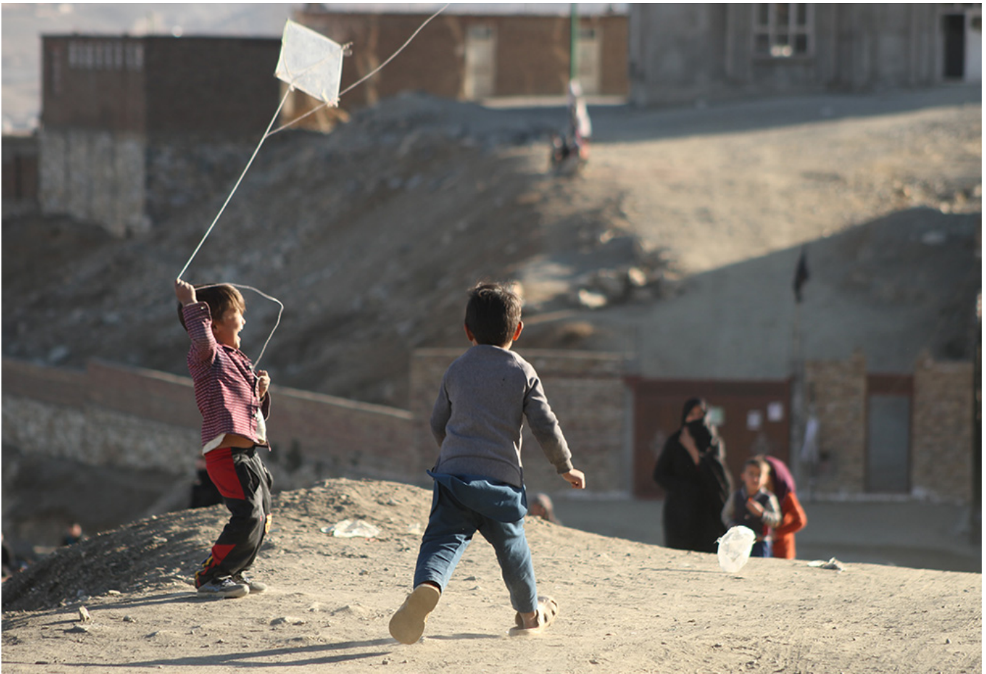
Children fly a kite in Afghanistan.

Even so, Afghans often felt looked down upon by the Americans. One governor of Kandahar province said a U.S.-led hand-washing humanitarian project was an "insult to the people. Here people wash their hands five times a day for prayers."