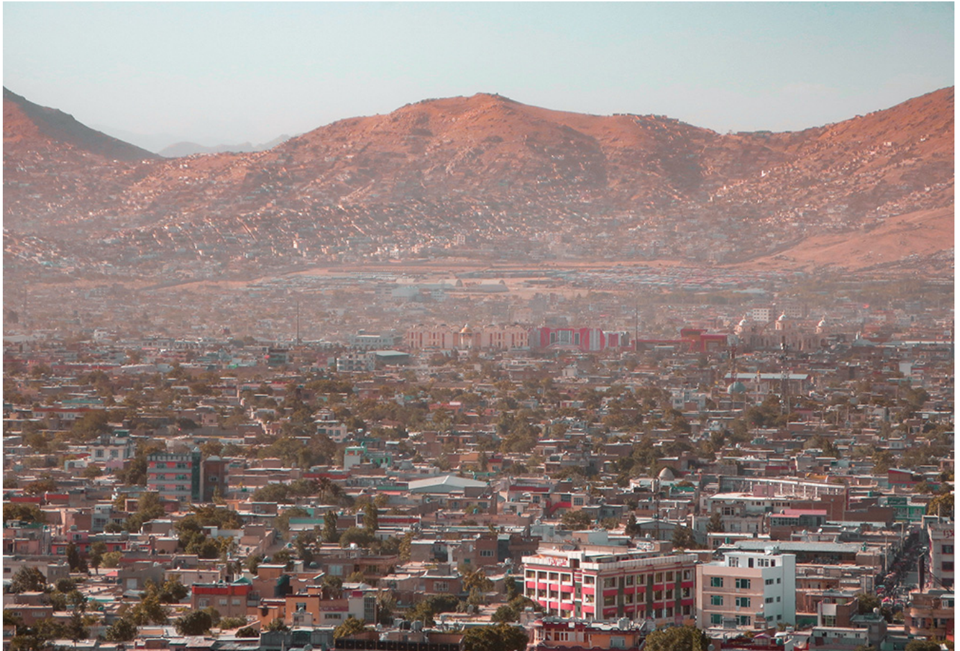
Kabul