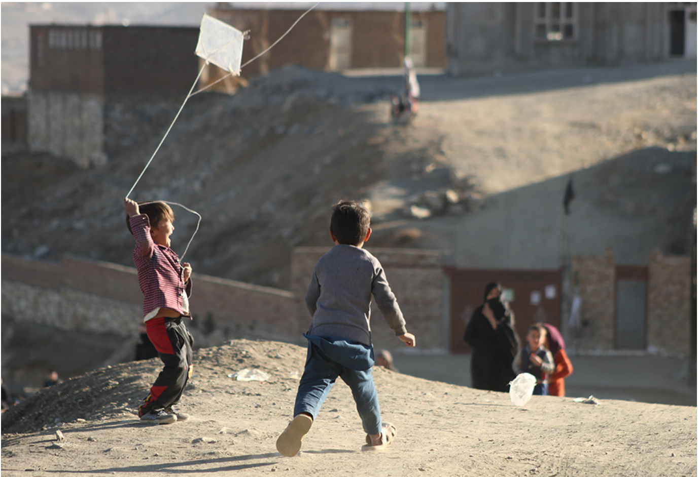
Children fly a kite in Afghanistan.

Even so, Afghans often felt looked down upon by the Americans. One governor of Kandahar province said a U.S.-led hand-washing humanitarian project was an "insult to the people. Here people wash their hands five times a day for prayers."