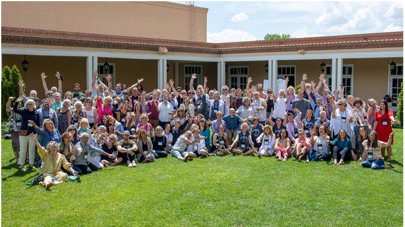
A group photo of most of the members of the 2022 and 2023 cohorts of the Living School, taken in a courtyard of the inn at Albuquerque, New Mexico, in late July

At times, that made keeping up and feeling connected to my classmates and our studies more than a little challenging. Even though our class of about 200 was broken into small "circle groups" of about 10 people each, with whom we met regularly via Zoom to talk about what we were learning and our lives in general, and while we were grateful for the technology that allowed us to do so, it was a wan substitute for being together in person.