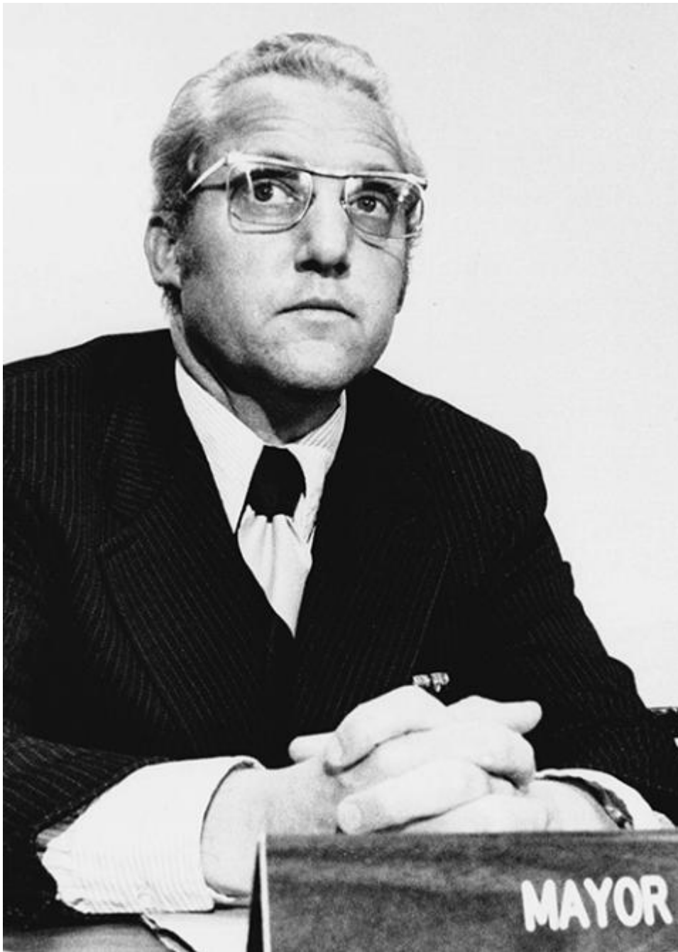
New Orleans Mayor Moon Landrieu on March 27, 1973, at a news conference in Washington, D.C., on the impact of the federal budget on the nation's cities