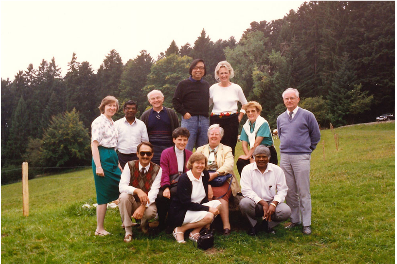
The staff of the World Council of Churches' Commission on World Mission and Evangelism in 1989 in Switzerland

Her initial development as a wisdom figure in Hong Kong had become the inspiring prelude to a work that enabled her to be a key negotiator on behalf of the Vatican in worldwide venues. Over the decades, her work brought her to engagements with some of the most prestigious world church leaders in Moscow, Rome, Guatemala, Ecuador, Peru, Argentina, Albania and more.