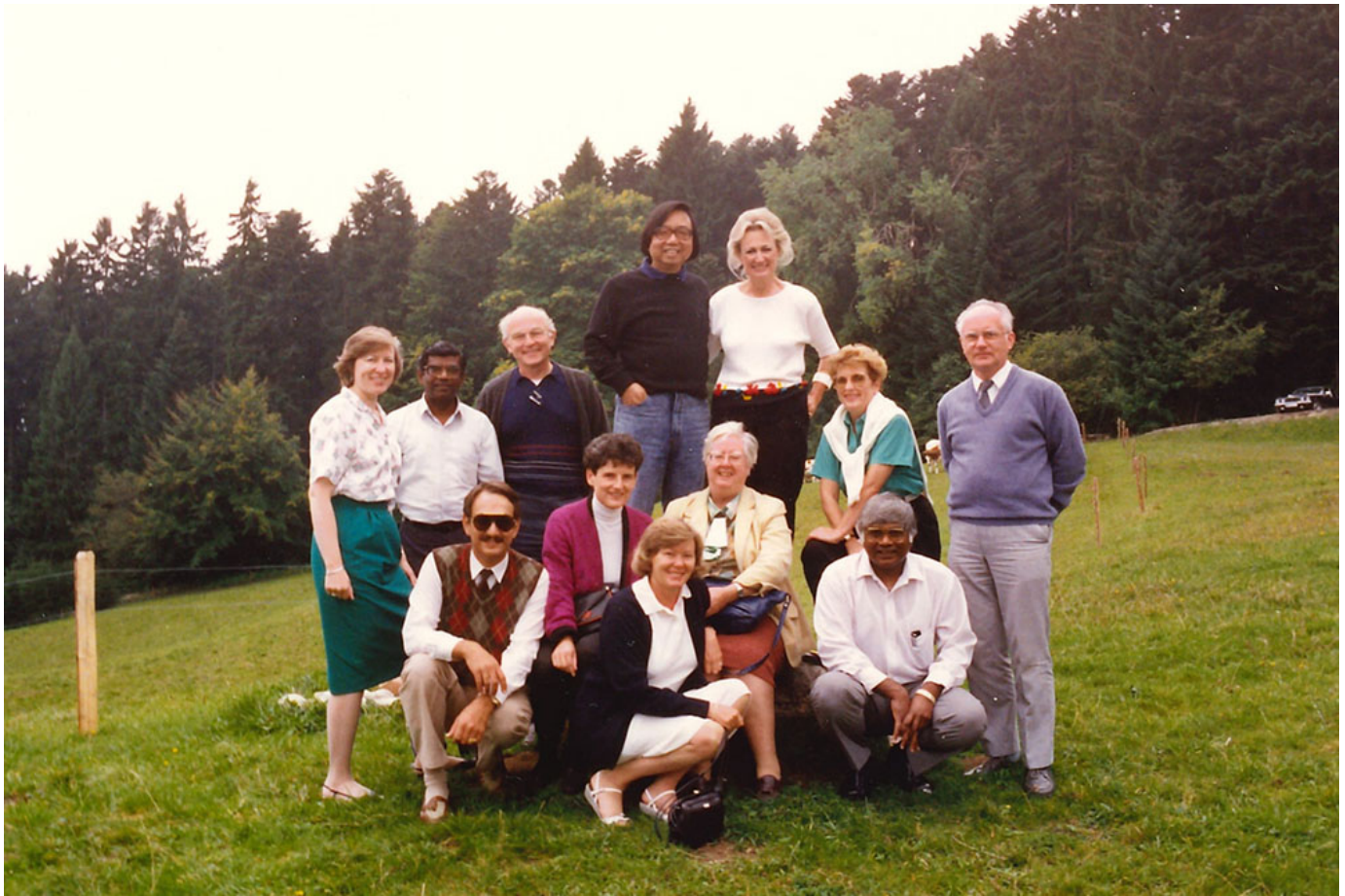
The staff of the World Council of Churches' Commission on World Mission and Evangelism in 1989 in Switzerland

Her initial development as a wisdom figure in Hong Kong had become the inspiring prelude to a work that enabled her to be a key negotiator on behalf of the Vatican in worldwide venues. Over the decades, her work brought her to engagements with some of the most prestigious world church leaders in Moscow, Rome, Guatemala, Ecuador, Peru, Argentina, Albania and more.