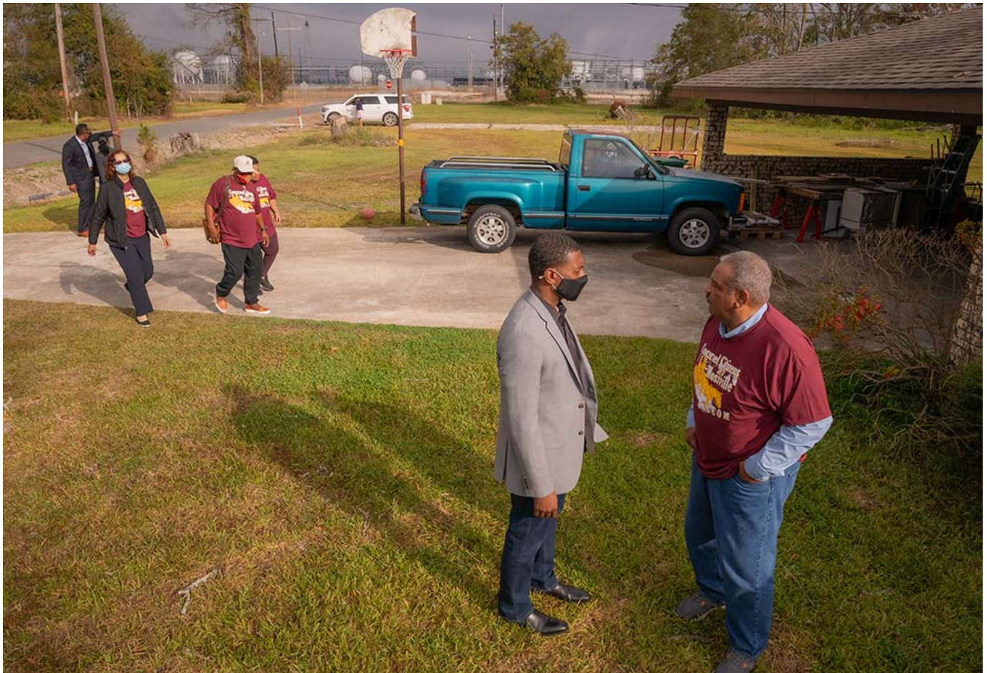
U.S. Environmental Protection Agency Administrator Michael Regan, left, meets with community members in Mossville, Louisiana, in November 2021 as part of an environmental justice tour of three Southern states.

"My dream for the future includes clean air. It includes clean water. It includes clean energy. My dream for the future includes the Environmental Justice for All Act," she continued.