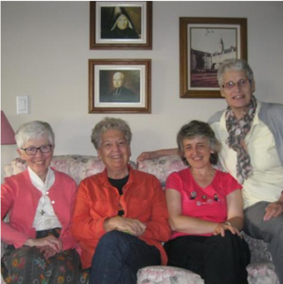
Members of the St. Kateri local community of Ursulines of Jesus

happiness of others and spread this love around them, even to the poorest, in silent or even hidden gestures. This is what so many religious men and women do throughout the world, although they certainly are not the only ones.