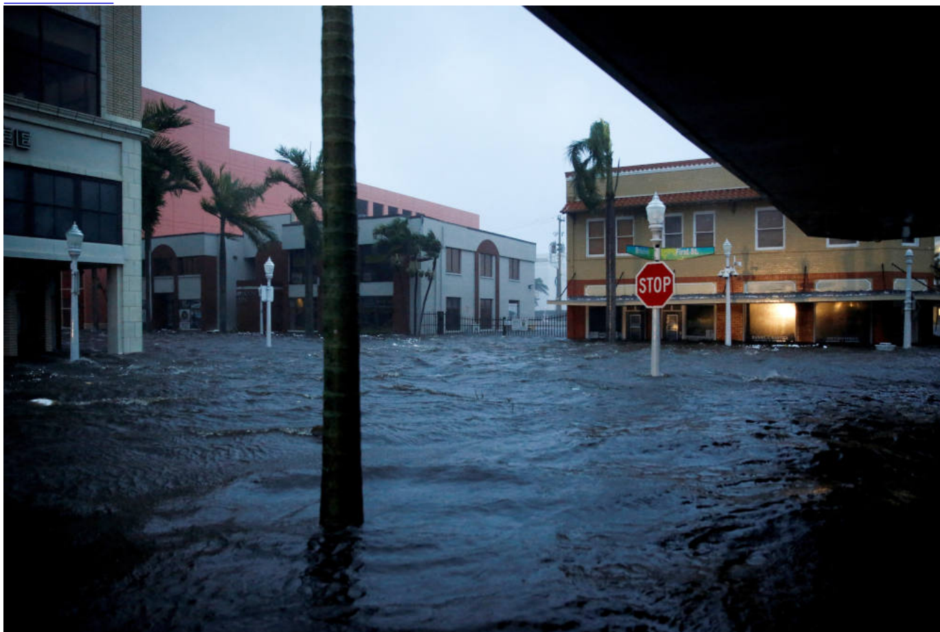
Floodwaters cover a road after Hurricane Ian made landfall in Fort Myers, Fla., Sept. 28, 2022.