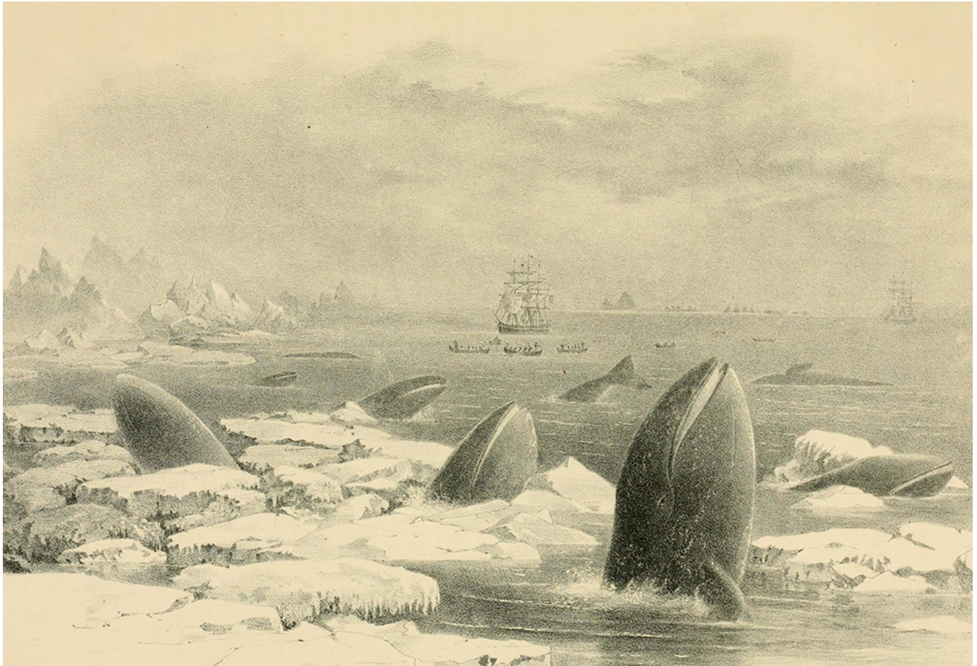
"California Grays Among the Ice" by Charles Melville Scammon, 1874

It's easy to see near the end of something and mistake that closeness for the end itself.