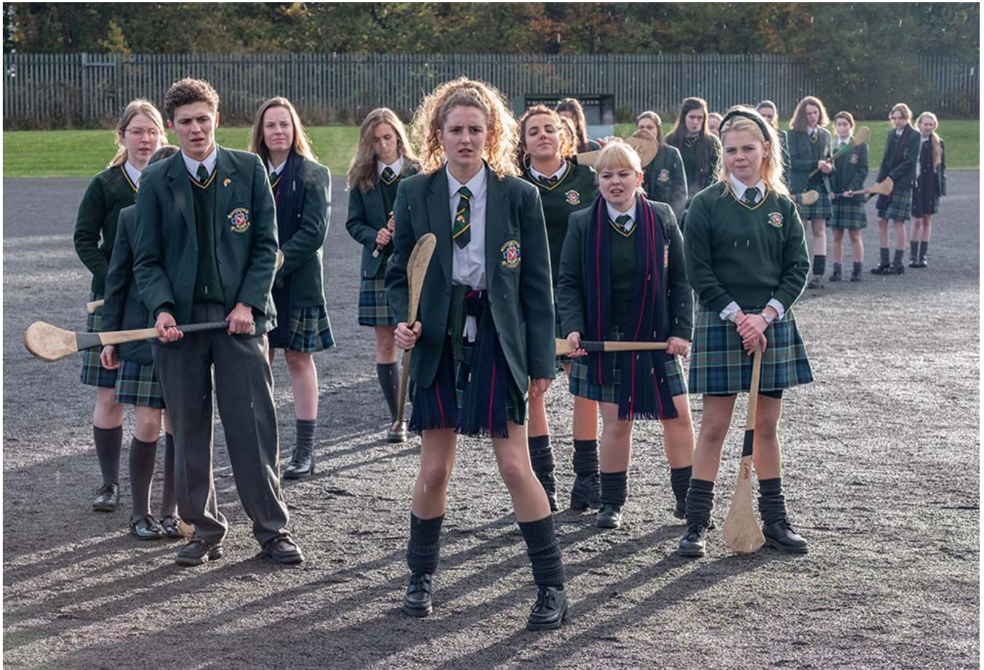
The cast of "Derry Girls" in Season Two

Father Peter's attempt to boil it all down to "We all feel, love, dream" only confuses the group. In the end, the kids find their own common ground: parents.