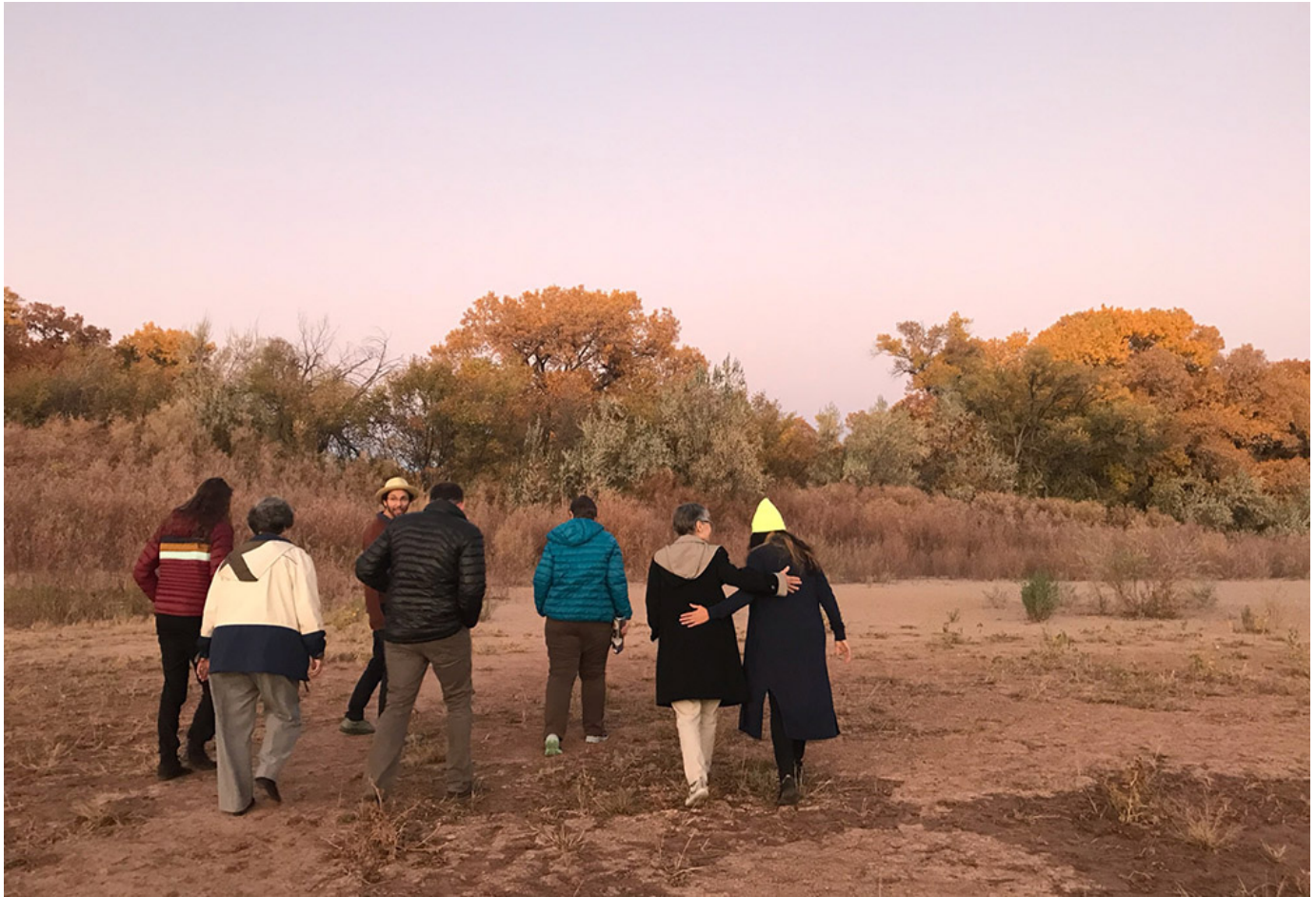
The Nuns and Nones team on the Rio Grande, October 2021