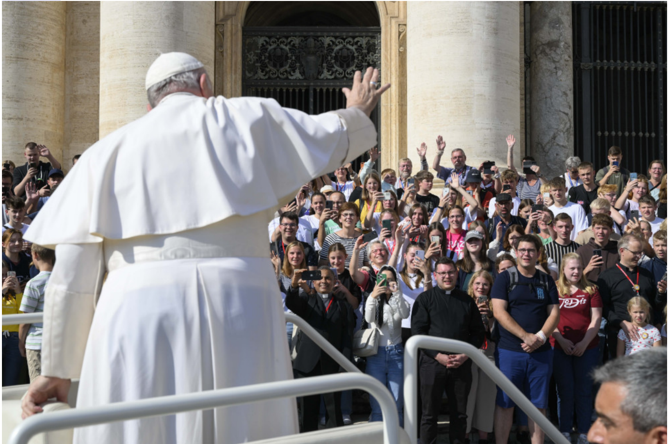
Pope Francis greets the crowd during his general audience in St. Peter's Square at the Vatican Oct. 12.