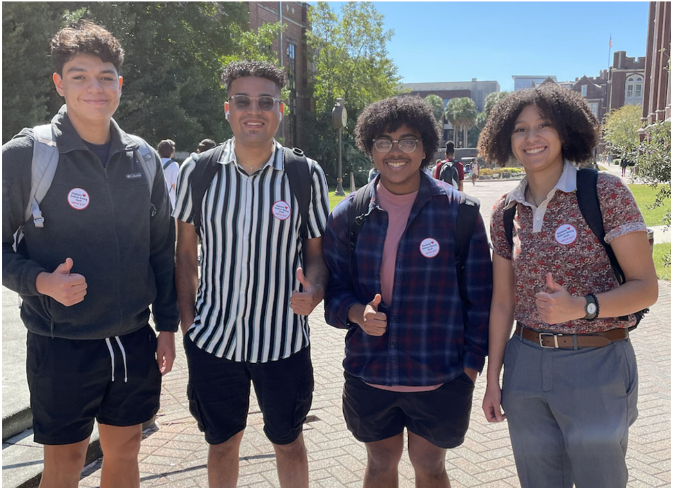
Students at Loyola University New Orleans show their support for food service workers' right to organize by sporting pro-union stickers.