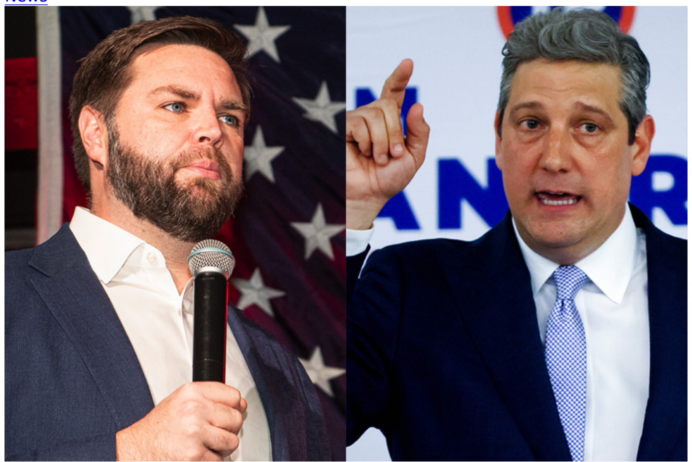
Left: J.D. Vance, Republican candidate for U.S. senator in Ohio, speaks at a campaign event in Medina, Ohio, Oct. 21. Right: Rep. Tim Ryan, D-Ohio, running for the open U.S. Senate seat in Ohio, speaks May 3 in Columbus.