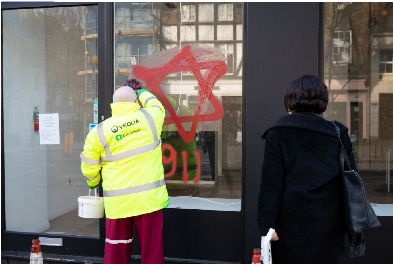
A worker removes antisemitic graffiti on a shop window in the Belsize Park neighborhood of London Dec. 29, 2019.