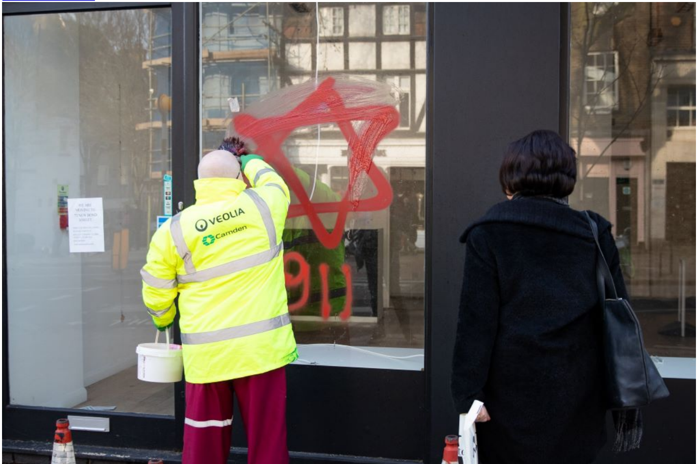
A worker removes antisemitic graffiti on a shop window in the Belsize Park neighborhood of London Dec. 29, 2019.