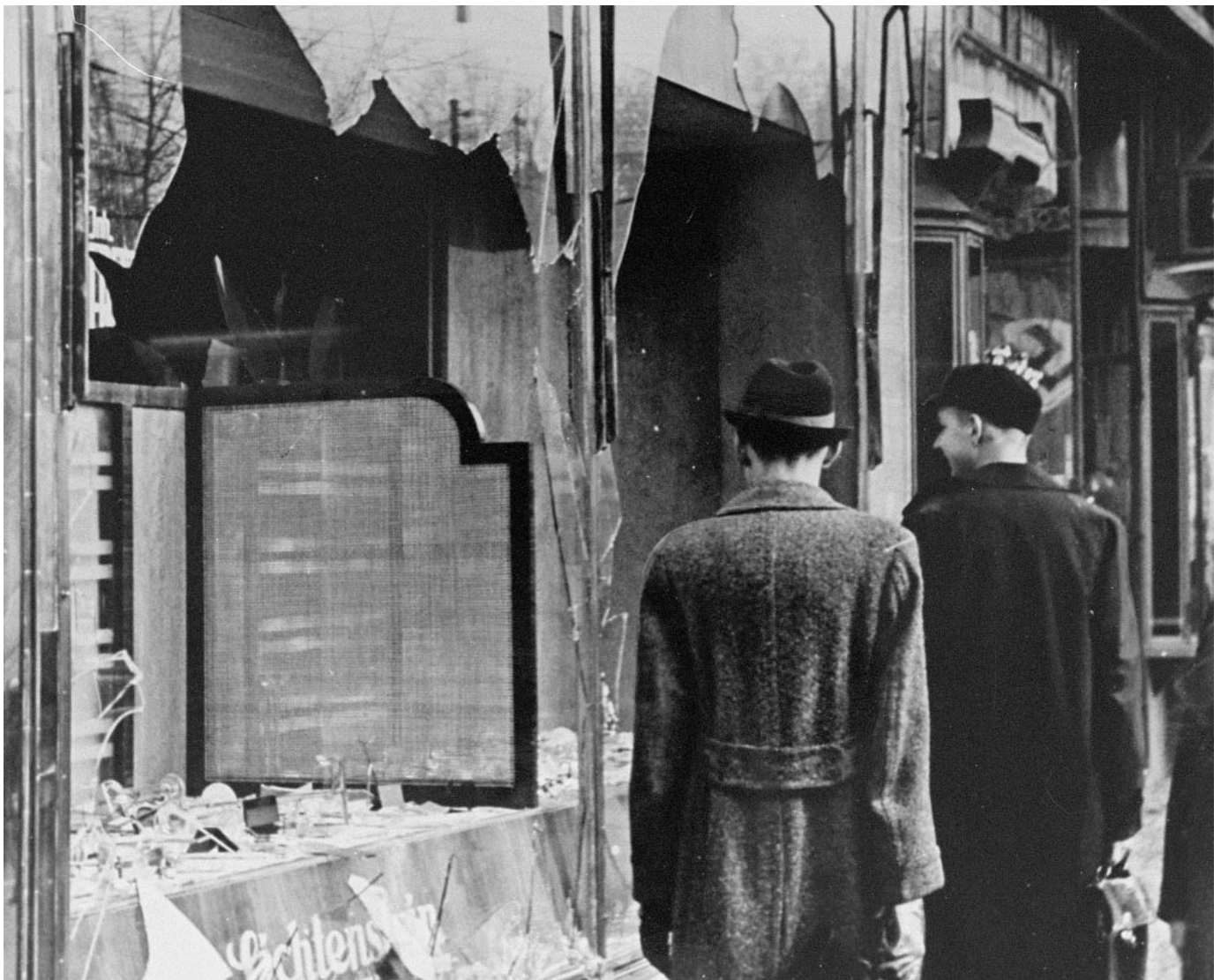
Germans pass the broken shop window of a Jewish-owned business in Berlin that was destroyed Nov. 9-10, 1938, during Kristallnacht, or the "Night of Broken Glass,"

But as much as they misunderstand medieval civilization and the role of liturgy in culture, they are, unfortunately, correct about the antisemitism of medieval Europe. The problem is that instead of viewing medieval antisemitism with horror, as something for which the church should repent, they view it with approval, as something the church should reclaim.