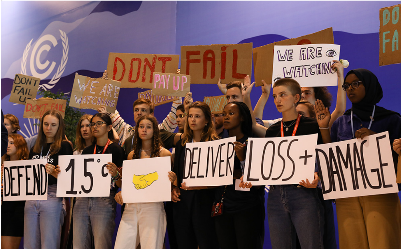
Young activists demonstrate at COP27 in Sharm el-Sheikh, Egypt, Nov. 19.

"We emphasize that any implementation of climate solutions must be anchored on the following three pillars: justice, equity, and solidarity," the statement said.