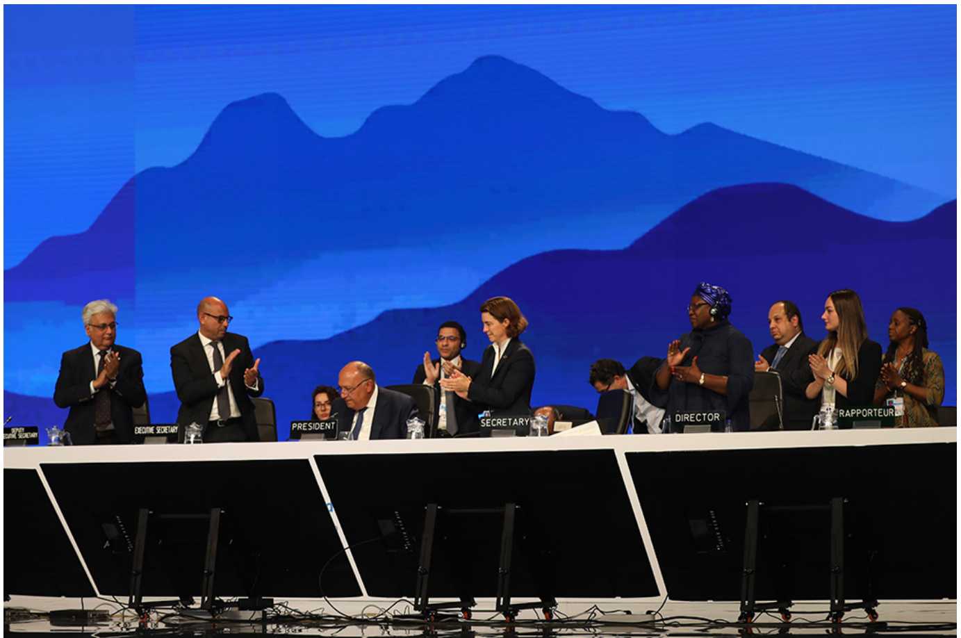
The closing plenary of COP27 in Sharm el-Sheikh, Egypt, Nov. 20

"My worry is that many things have been agreed on before but have never been implemented," said Munene, who called on world leaders to now move to implement the loss-and-damage fund.