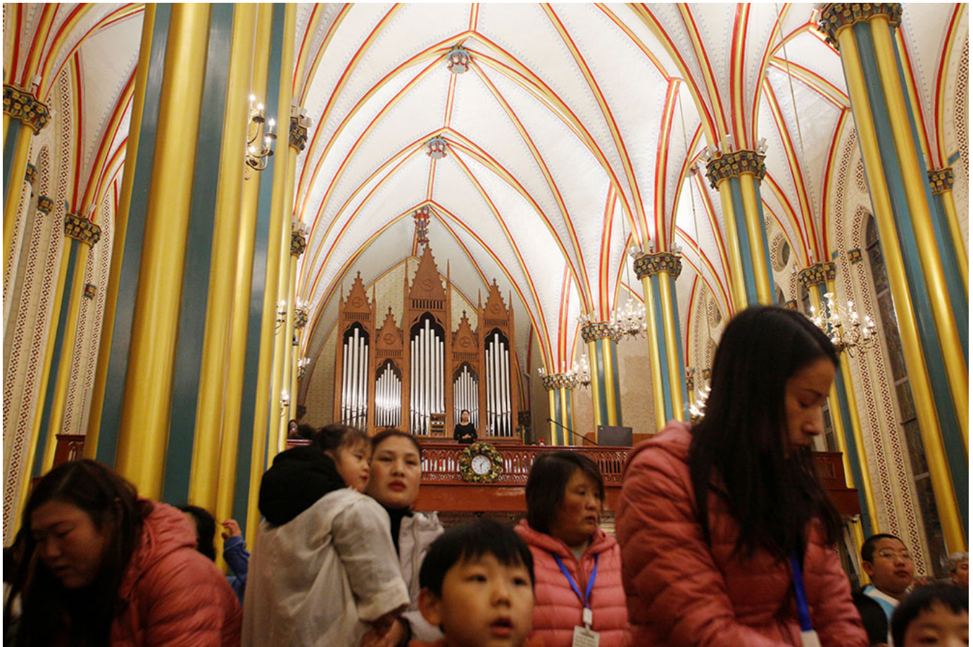
Worshippers attend a mass at Xishiku Cathedral, also known as Beitang, on Christmas Eve in Beijing in 2019.

While the specifics of the 2018 Vatican-China agreement have never been made public, the accord broadly outlines the procedures for selecting bishops for the country that are approved by the Holy See ahead of the ordination.