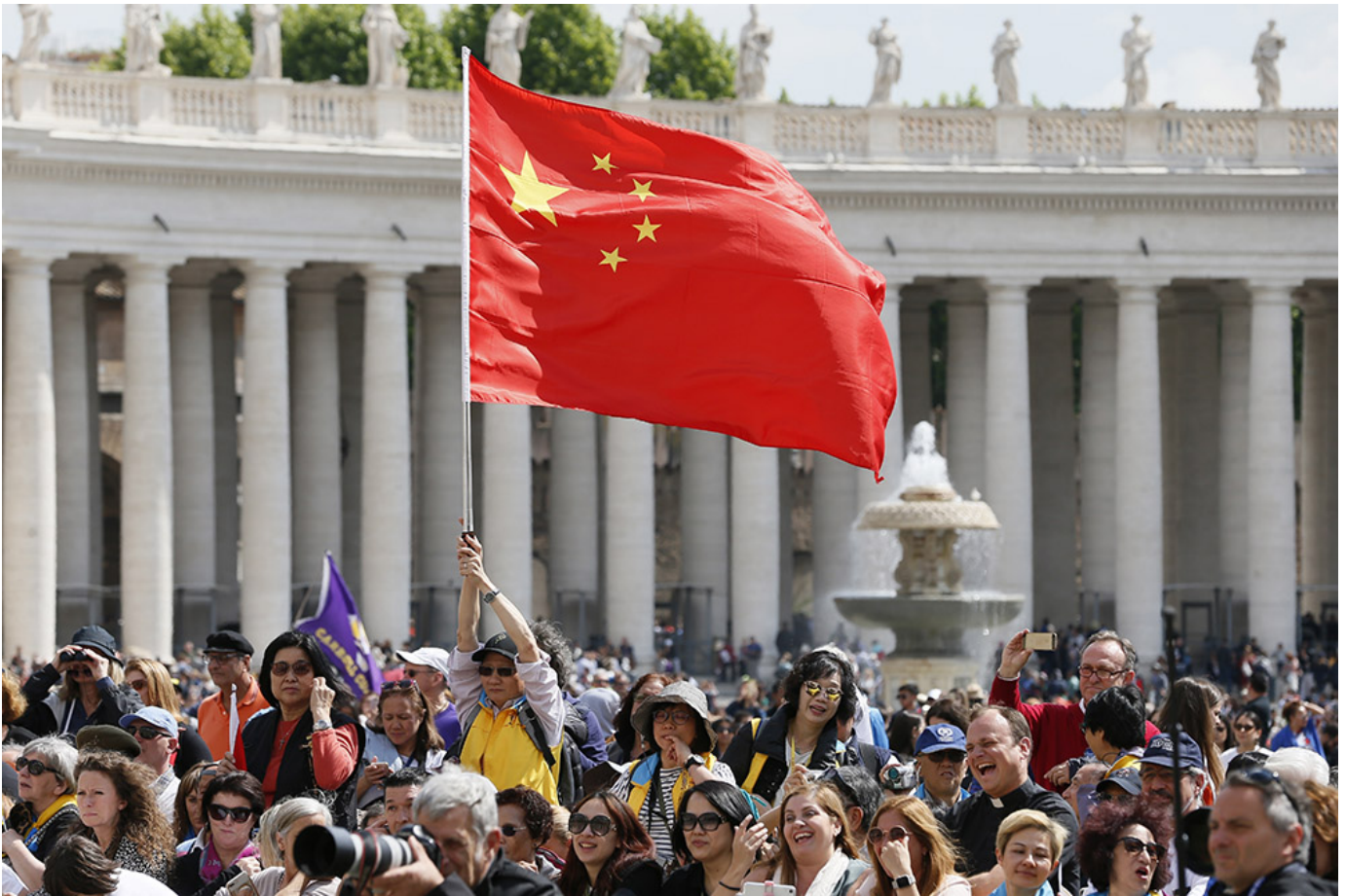
A man waves China's flag as Pope Francis leads his general audience in St. Peter's Square at the Vatican May 22, 2019.