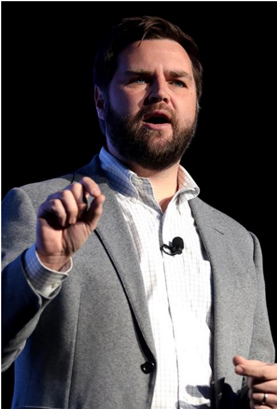
J.D. Vance speaks at the 2021 Southwest Regional Conference hosted by Turning Point USA at the Arizona Biltmore in Phoenix.