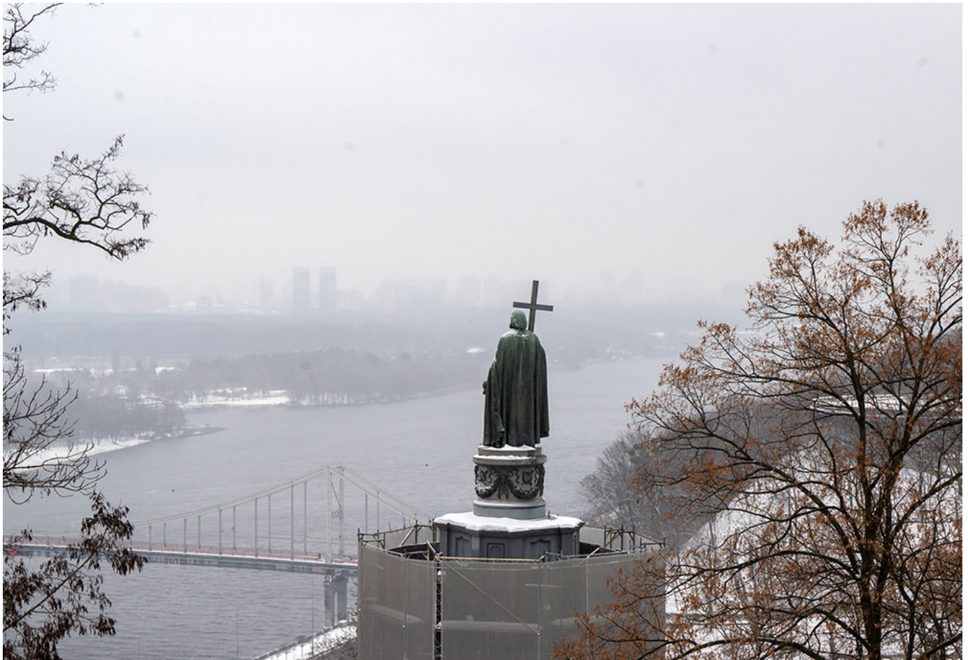
A statue of Vladimir the Great overlooks Dnipro River in Kyiv, Ukraine, on Dec. 7.

"At a parish, a little old lady approached me to say, 'We live in constant terror, we are afraid, it is good that you talk to us,' " he recounted to the journalists who visited him at his cathedral Dec. 9.