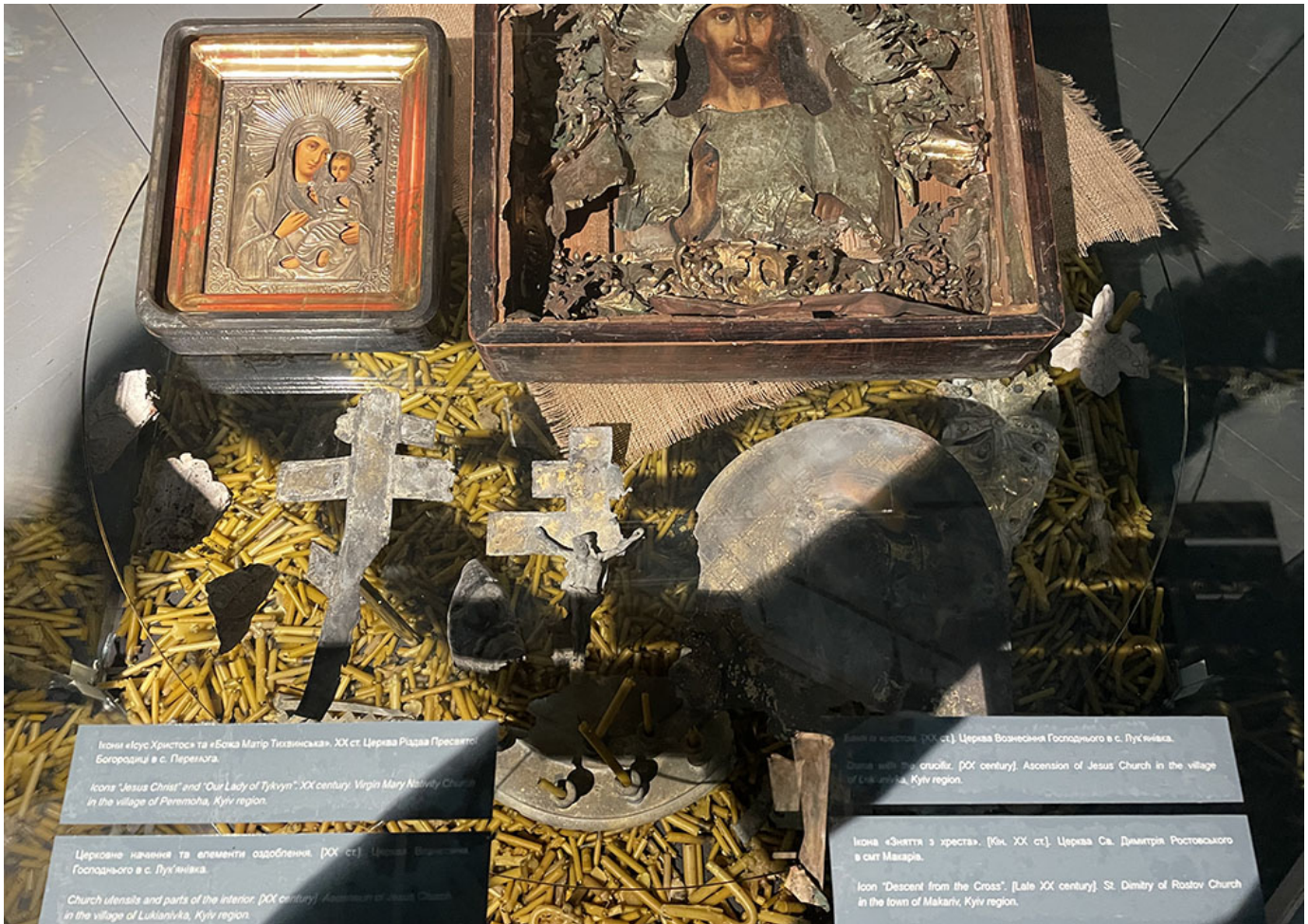
Damaged icons and crucifixes sit atop Russian bullets at the "Ukraine Crucifixion" exhibit in Kyiv, Ukraine, on Dec. 8.

And be it in neighboring Poland — where 8 million Ukrainian refugees and displaced persons have crossed into since the war's outbreak — or among those who remain in Ukraine, there is widely shared determination, often spoken of with religious conviction, that however long is necessary, the country is willing to continue battling Russia to defend its territorial integrity.