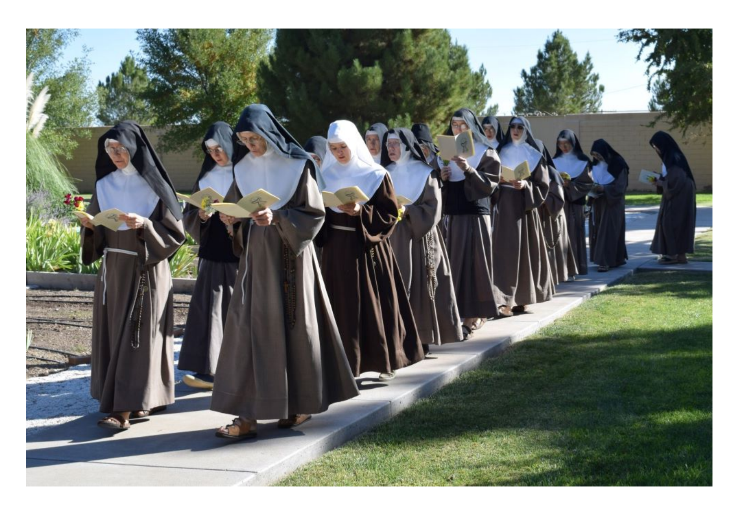
Poor Clare Sisters process during a Eucharistic celebration at the Roswell, New Mexico, monastery in October 2016. (Julie A. Ferraro)

Of course, for the majority of communities of women religious, this lack of activity is not the case. But updating the website can fall by the wayside when other matters take precedence, such as providing adequate care for aging members or determining the future of the community's land and buildings.