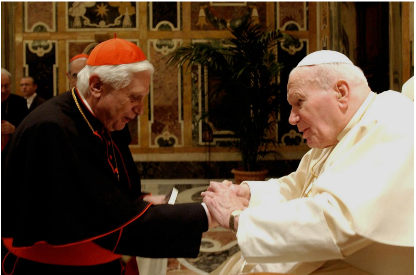
Cardinal Joseph Ratzinger greets Pope John Paul II during a 2004 ceremony at the Vatican.