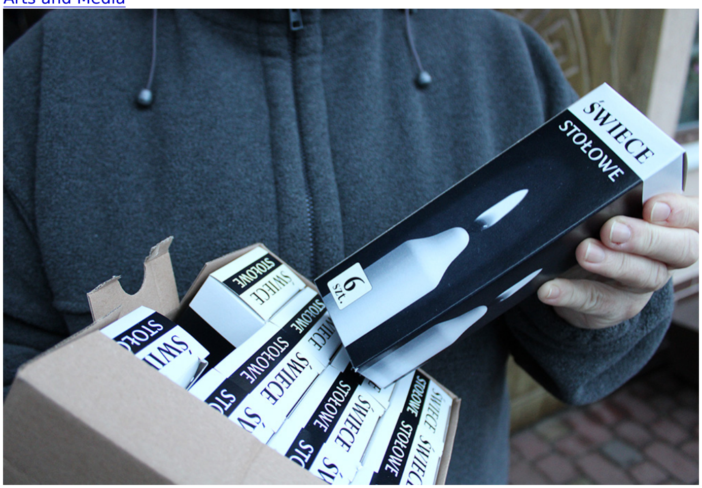
Blog Arts and Media

The need for candles has taken on urgency with increased electrical blackouts in Ukraine after a recent torrent of Russian bombardments strained the country's power grid. These candles, brought from Poland, were distributed to residents of Zhovkva, Ukraine, at a Dominican convent.