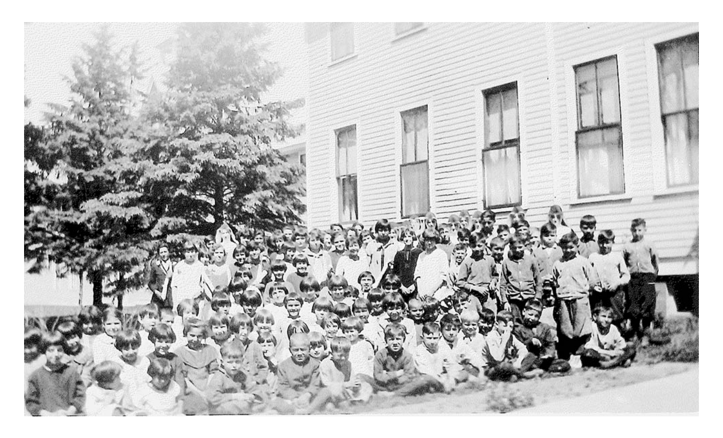
St. Mary's Catholic Indian Boarding School students pose for a photo during a school picnic during the 1922-23 school year.