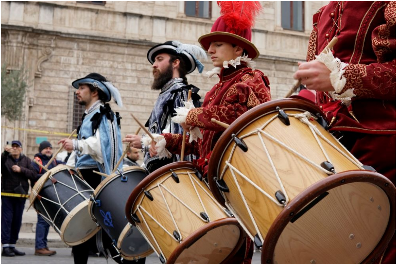
Drummers participate in a parade marking the feast of the Epiphany in Rome near the Vatican Jan. 6.