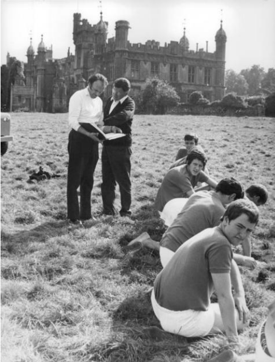
Pictured is a scene from the 1967 British comedy "Decline and Fall of a Birdwatcher" an adaption of Evelyn Waugh's first novel, "Decline and Fall," published in 1928.

is made of fame, privilege, power, class and socialite culture. Waugh tears the veil away in a scene that can't be forgotten. A mother who pursues a romantic affair with an awful man called John — who bears the same name as her young son — receives news that "John" had suffered a terrible accident. As it slowly dawns on her that the victim is her little boy and not her lover, her initial reaction is to thank God in relief — before bursting into tears. The horrible scene is compelling because it's so authentically human.