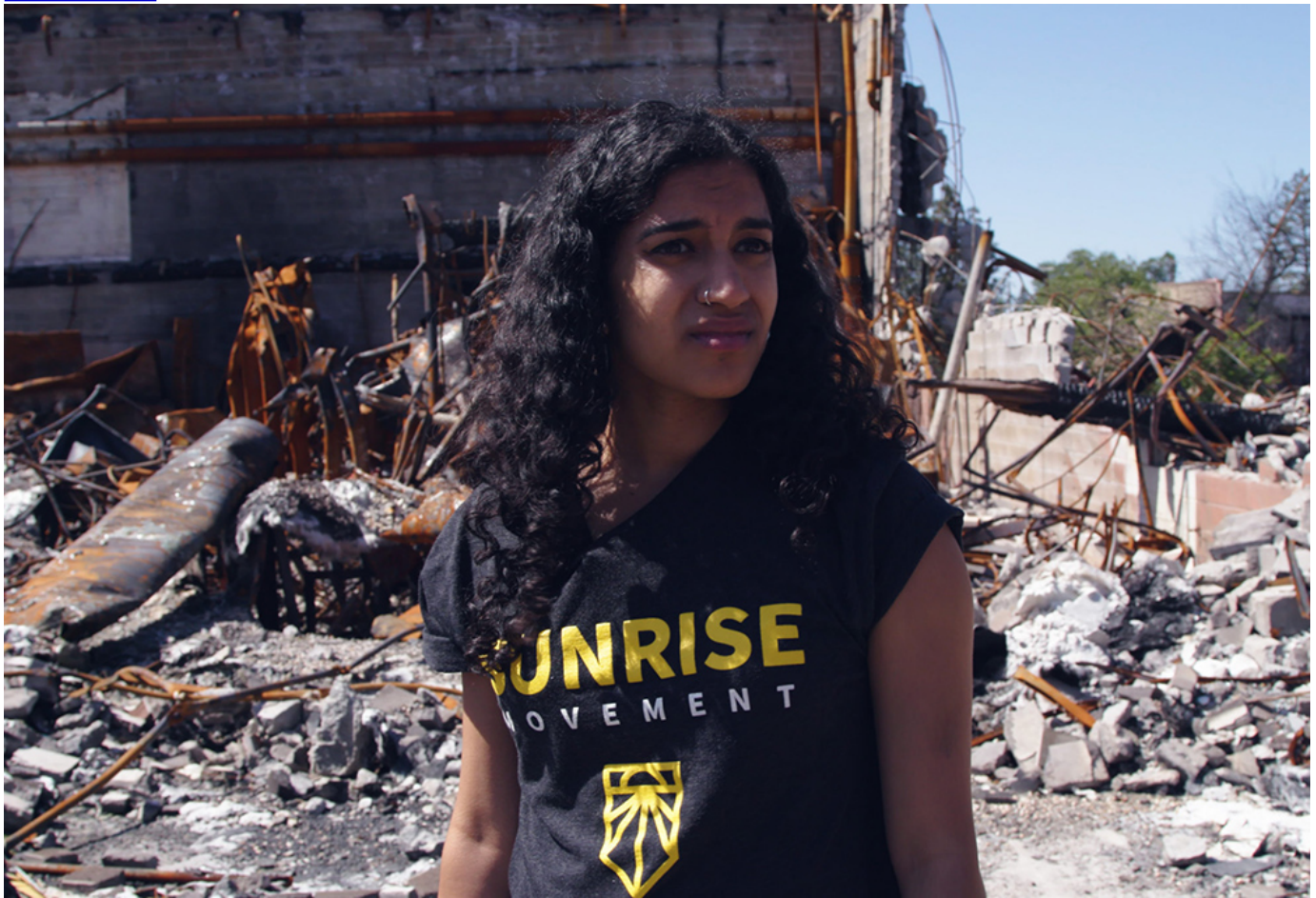
Varshini Prakash, co-founder and executive director of the Sunrise Movement, in "To the End"