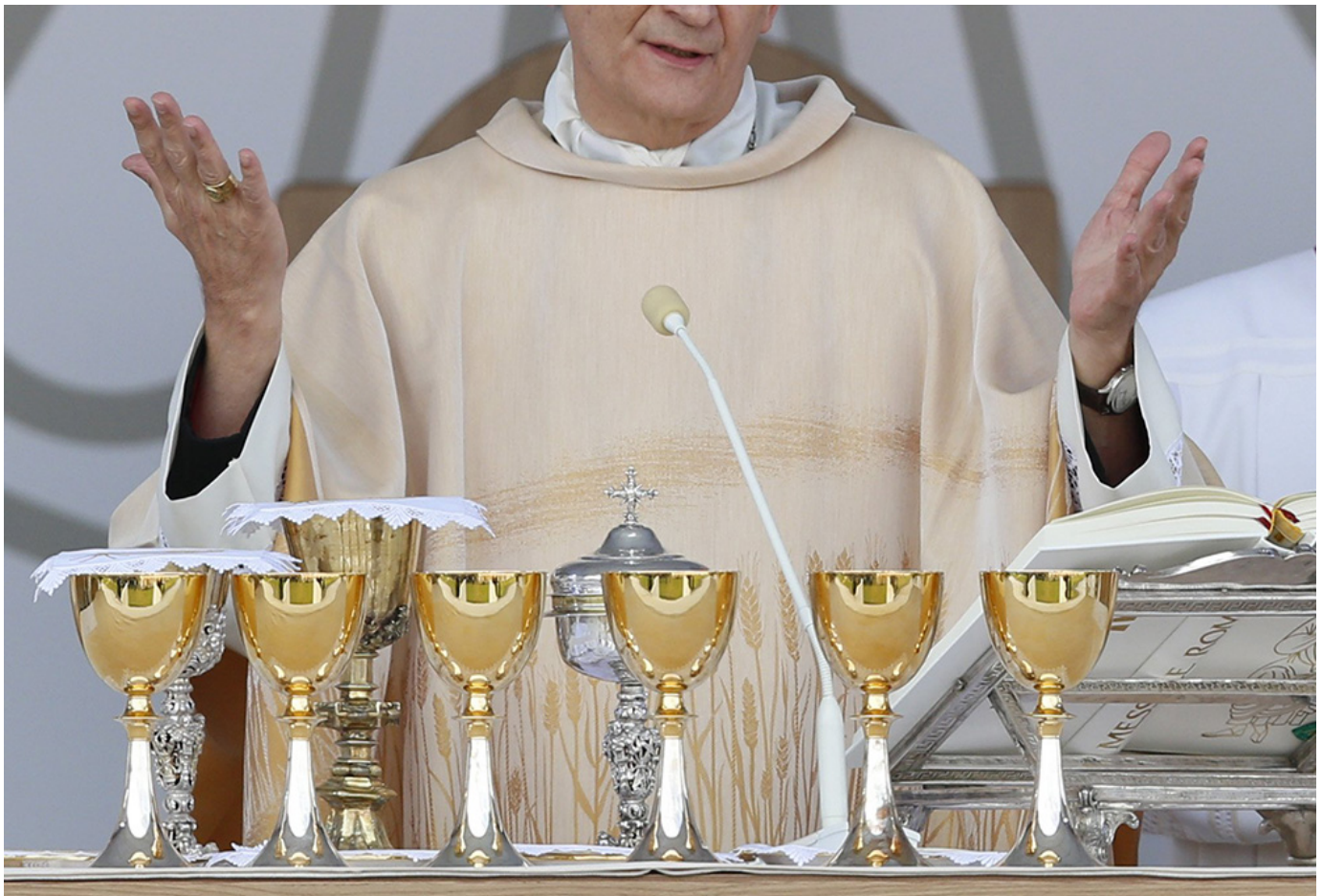
A cardinal celebrates the Eucharist during Italy's National Eucharistic Congress at the municipal stadium in Matera, Italy, Sept. 25, 2022.

Eucharistic Prayer IV prays, "Grant in your loving kindness to all who partake of this one Bread and one chalice that, gathered into one body by the Holy Spirit, they may truly become a living sacrifice in Christ to the praise of your glory."