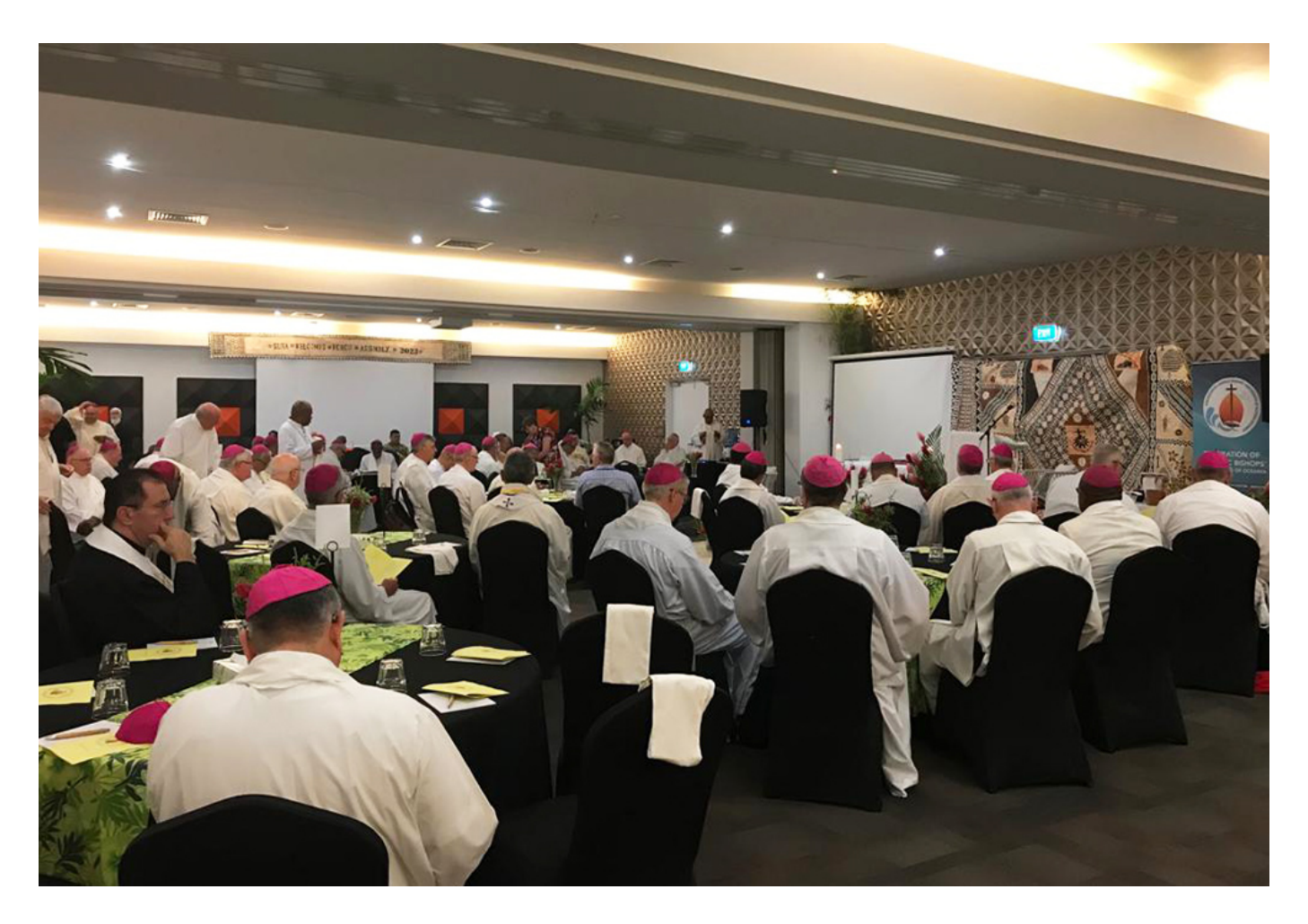
Bishops from Oceania gather Feb. 5-10 in Suva, Fiji. (Susan Pascoe)

Today, those cries are legion: Rapidly rising sea levels have <u>triggered</u> a wave of climate refugees seeking new homelands due to a number of small pacific islands becoming uninhabitable. An increase in cyclones has <u>wreaked</u> havoc on the region's economies and led to tremendous loss of lives and culture, and climate-induced migration has <u>threatened</u> new conflicts on land and at sea.