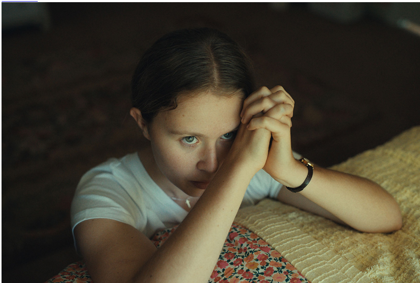
Eliza Scanlen in "The Starling Girl"