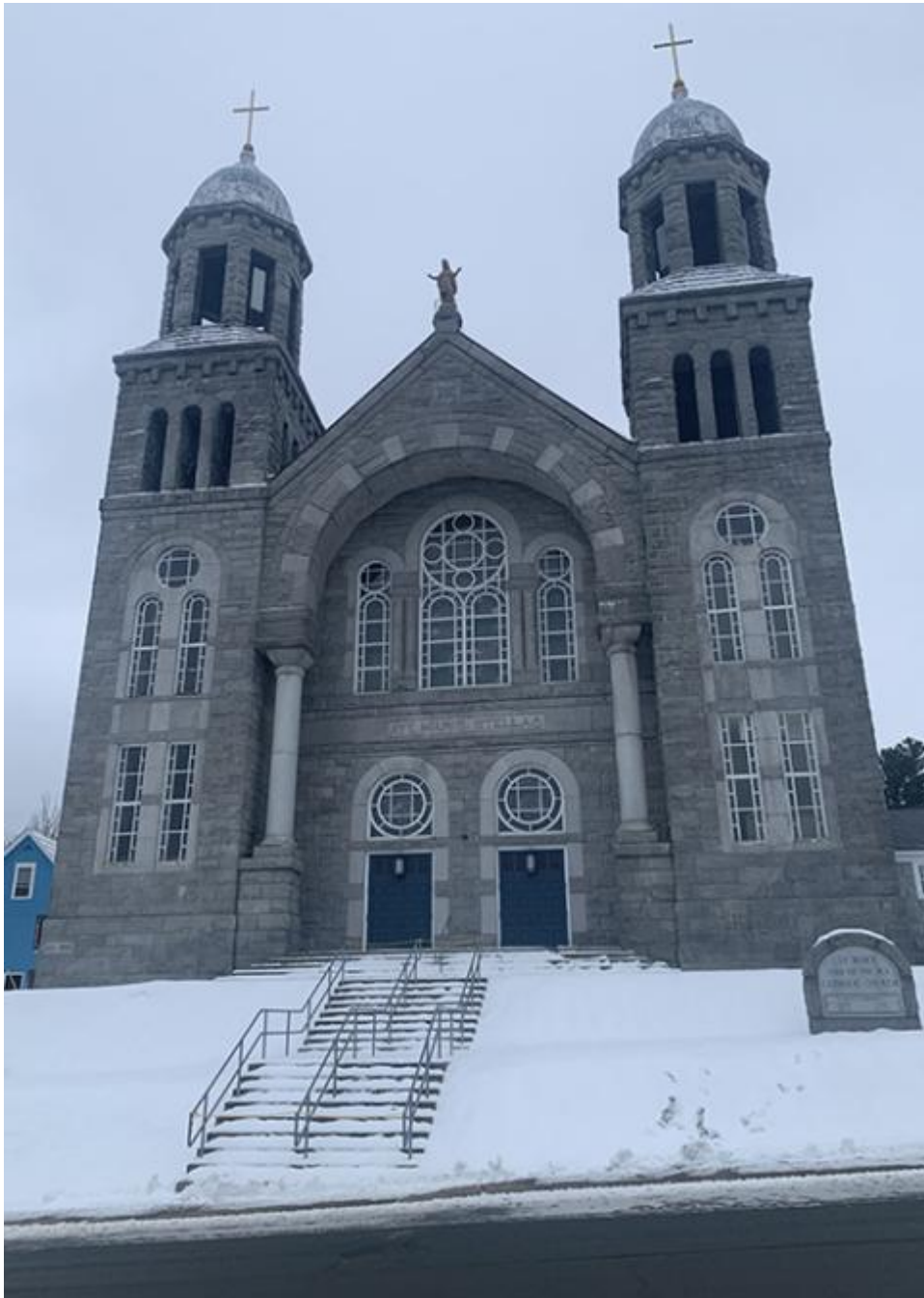
St. Mary Star of the Sea in Newport, Vermont

The story cast me back to the Temple in Jerusalem, where the sacrifice of horned oxen and rams was an essential part of liturgies. Like Moses, horns adorned the four corners of two altars of the Temple, one altar for the twice daily sacrifice of incense