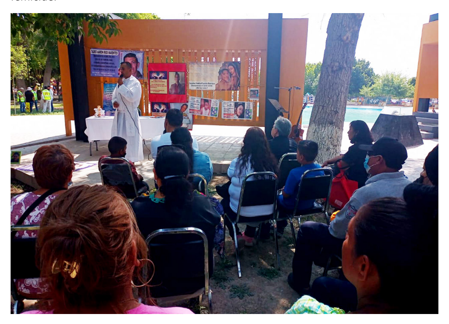
Eucharist at the VIDA Group's Mother's Day memorial in 2022

That is why we wanted to organize faith-based actions among collectives, such as the pilgrimage to Guadalupe and the Eucharist of the collectives seeking justice. This is where others that I also know very well come in, such as the Grupo de Madres Poderosas [Group of Powerful Mothers], mothers who have lost their daughters to femicide.