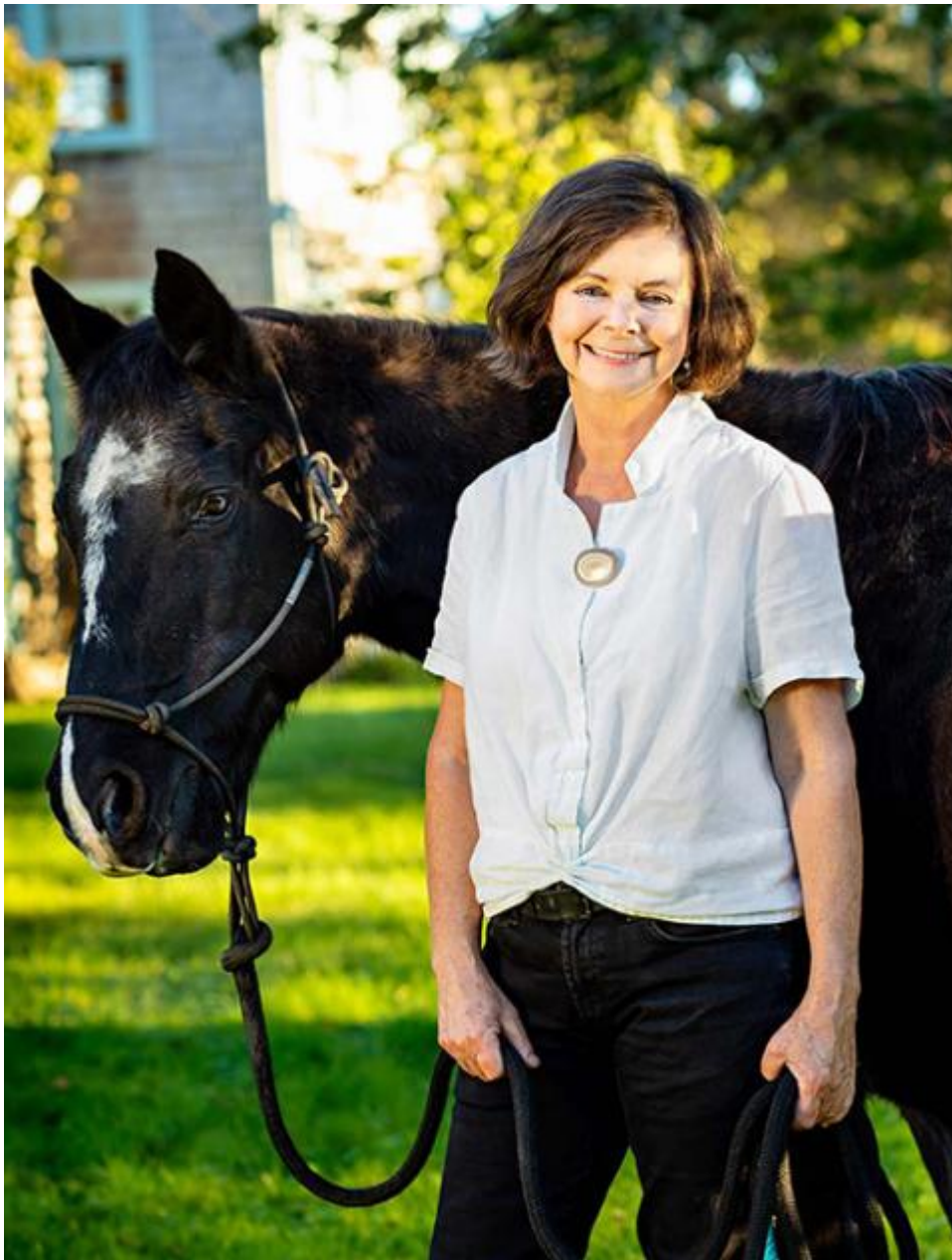
Geraldine Brooks, author of the novel Horse

Brooks immerses readers in 19th-century horse racing. The races of the period featured grueling 4-mile heats — and sometimes more than one. Sports newspapers covering horse races had better circulation than most other newspapers. Winning horses were better known and admired than most public figures. Gambling was rampant. The egos of wealthy and powerful owners were involved. Modern-day American football or worldwide soccer probably offer the best comparisons to the sport as it existed during the mid-19th century.