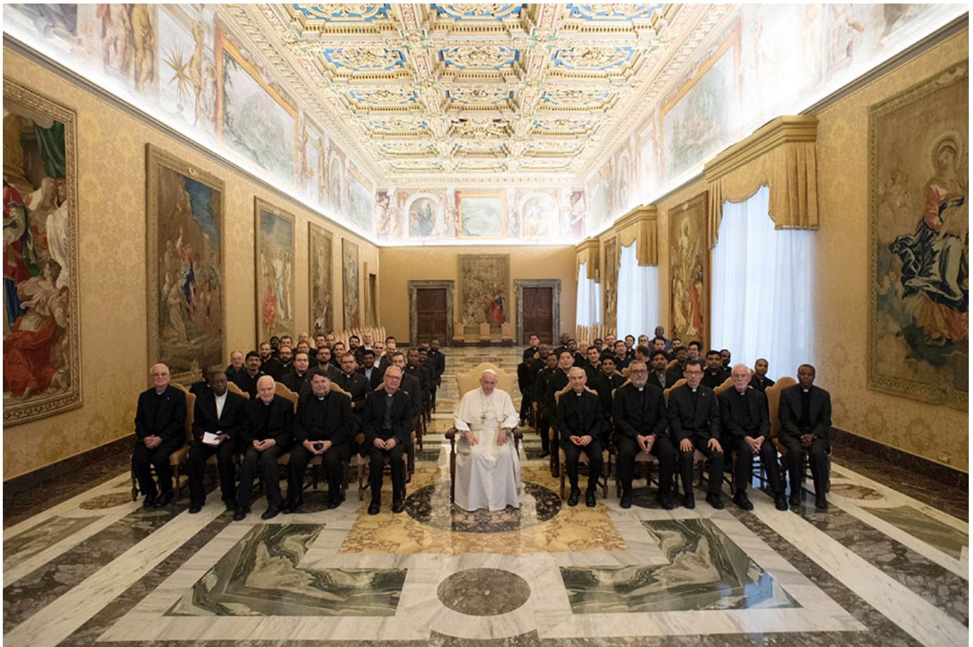
Pope Francis poses for a photo with faculty and staff of the Jesuits' International College of the Gesù in Rome during an audience at the Vatican Dec. 3, 2018.

For many Jesuits, having a member of their religious order elected pope was a bit of whiplash, given both the order's recent history in Rome, as well as Bergoglio's own history with the order.