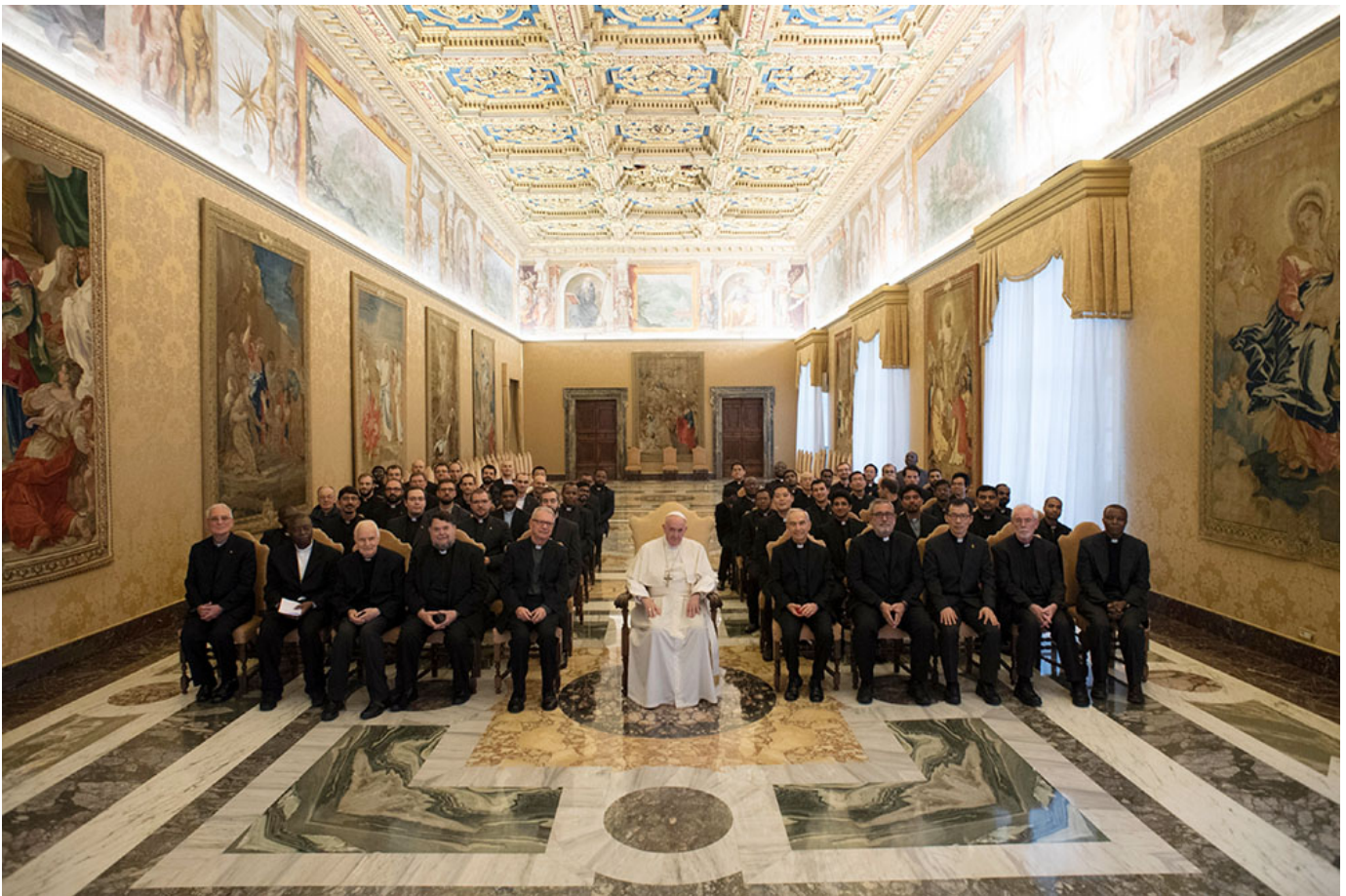
Pope Francis poses for a photo with faculty and staff of the Jesuits' International College of the Gesu 1 in Rome during an audience at the Vatican Dec. 3, 2018.

For many Jesuits, having a member of their religious order elected pope was a bit of whiplash, given both the order's recent history in Rome, as well as Bergoglio's own history with the order.