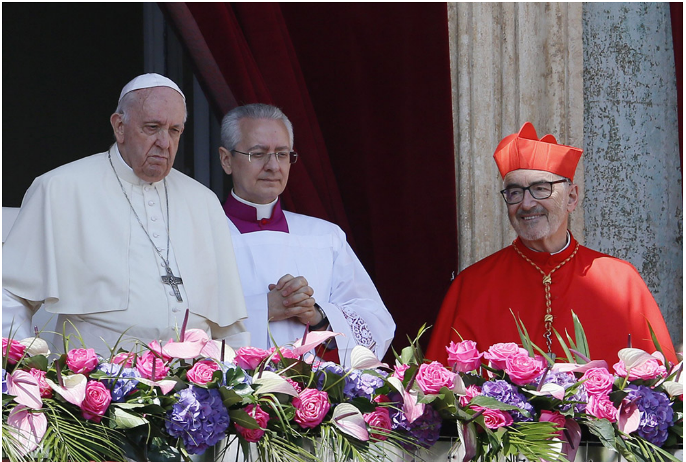
Cardinal Michael Czerny looks on as Pope Francis delivers his Easter message and blessing urbi et orbi ("to the city and the world") from the central balcony of St. Peter's Basilica at the Vatican April 17, 2022.

In Hollerich, the pope has placed the responsibility of drafting the eventual outcome document for the church's ongoing synod process — a signature project of the Francis papacy, meant to return the church to embracing the Second Vatican Council's call to listen to all of the church's members.