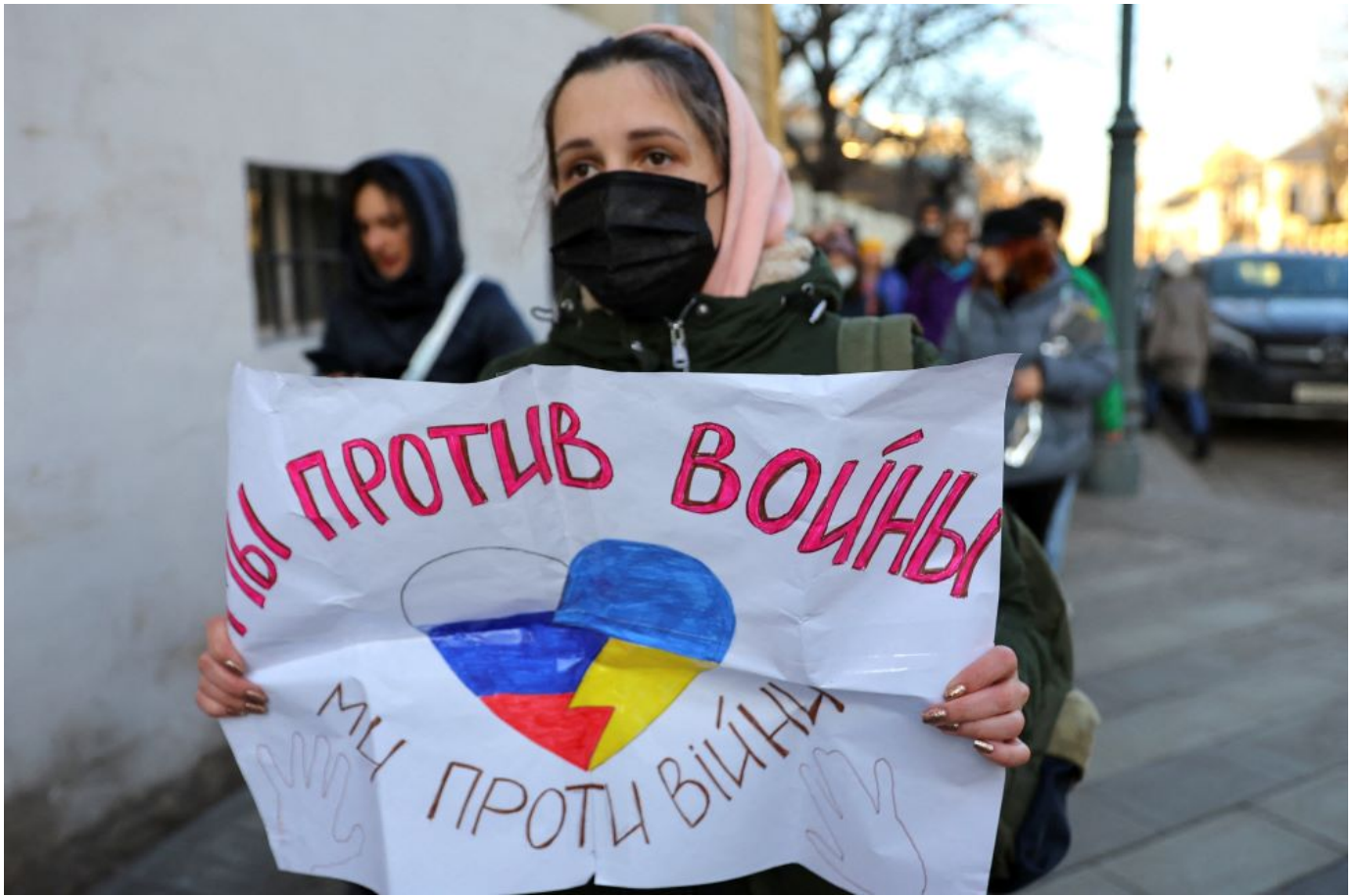
A young woman holds a sign that reads "We are against war" during a protest in Moscow Feb. 27, 2022, after Russia attacked Ukraine.

They would refuse to be part of any military, or follow a government law or decree that would require them to kill, torture, oppress and wage war.