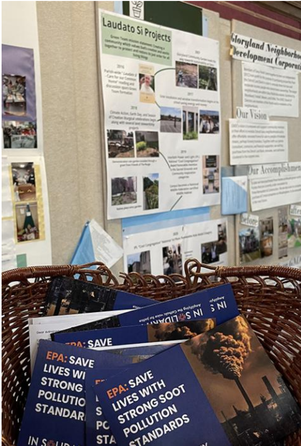
Postcards urging the EPA to lower allowable soot pollution standards are collected at the March 21 event at Gesu Catholic Church in Detroit.