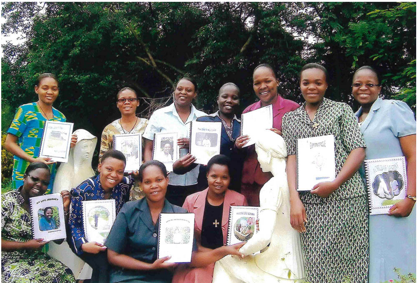
School Sisters of Notre Dame novices pose with their memoirs in Sunyani, Ghana.

The two books that followed were requested of me by my congregation. I knew that I could make them inspirational even as I told the facts in story form. I was happy to spread the good news!