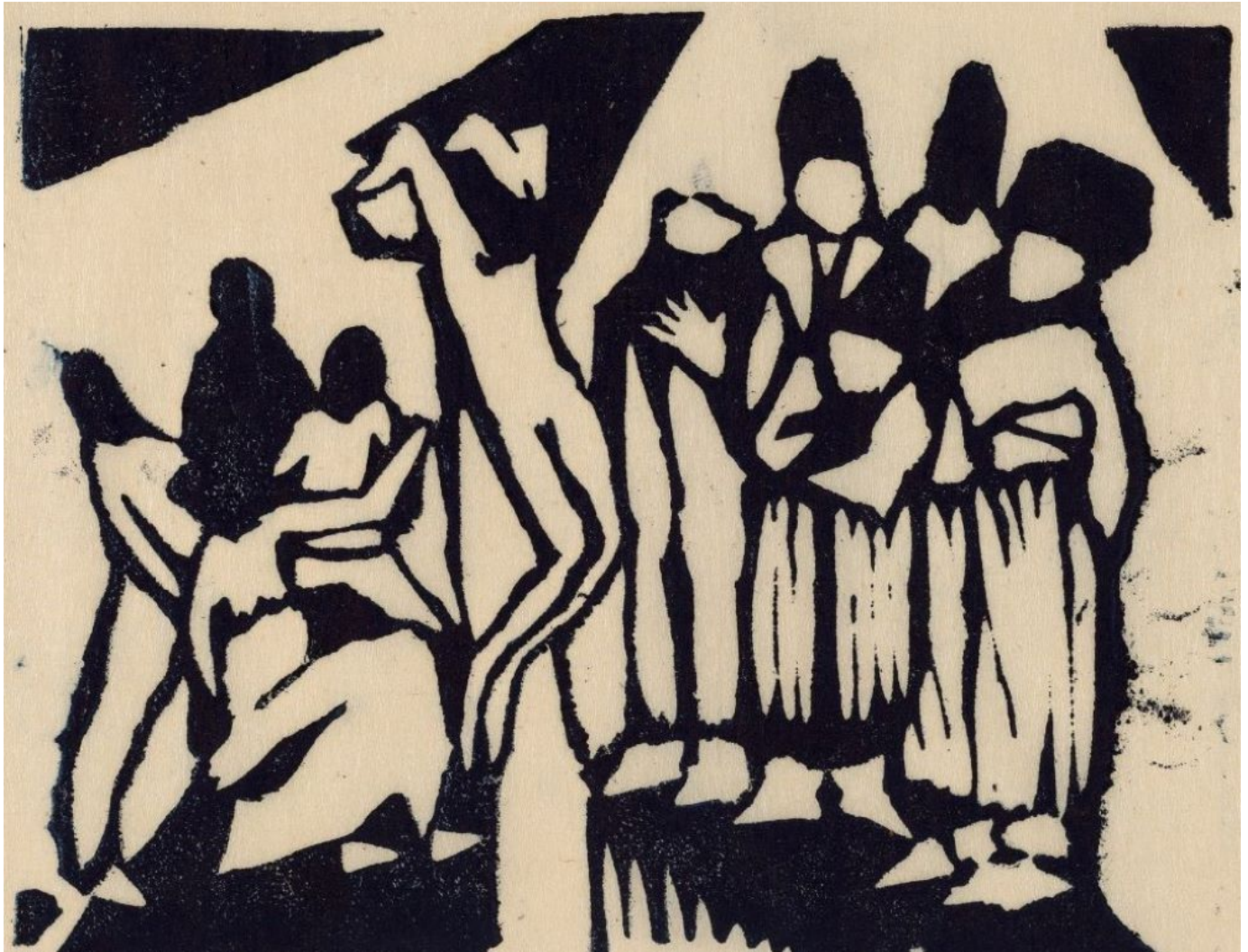
"Crucifixion I," 1913, by Wilhelm Morgner (German, 1891-1917)

heresy that contended that the deity of the Old Testament was not the God of love revealed by Jesus Christ.