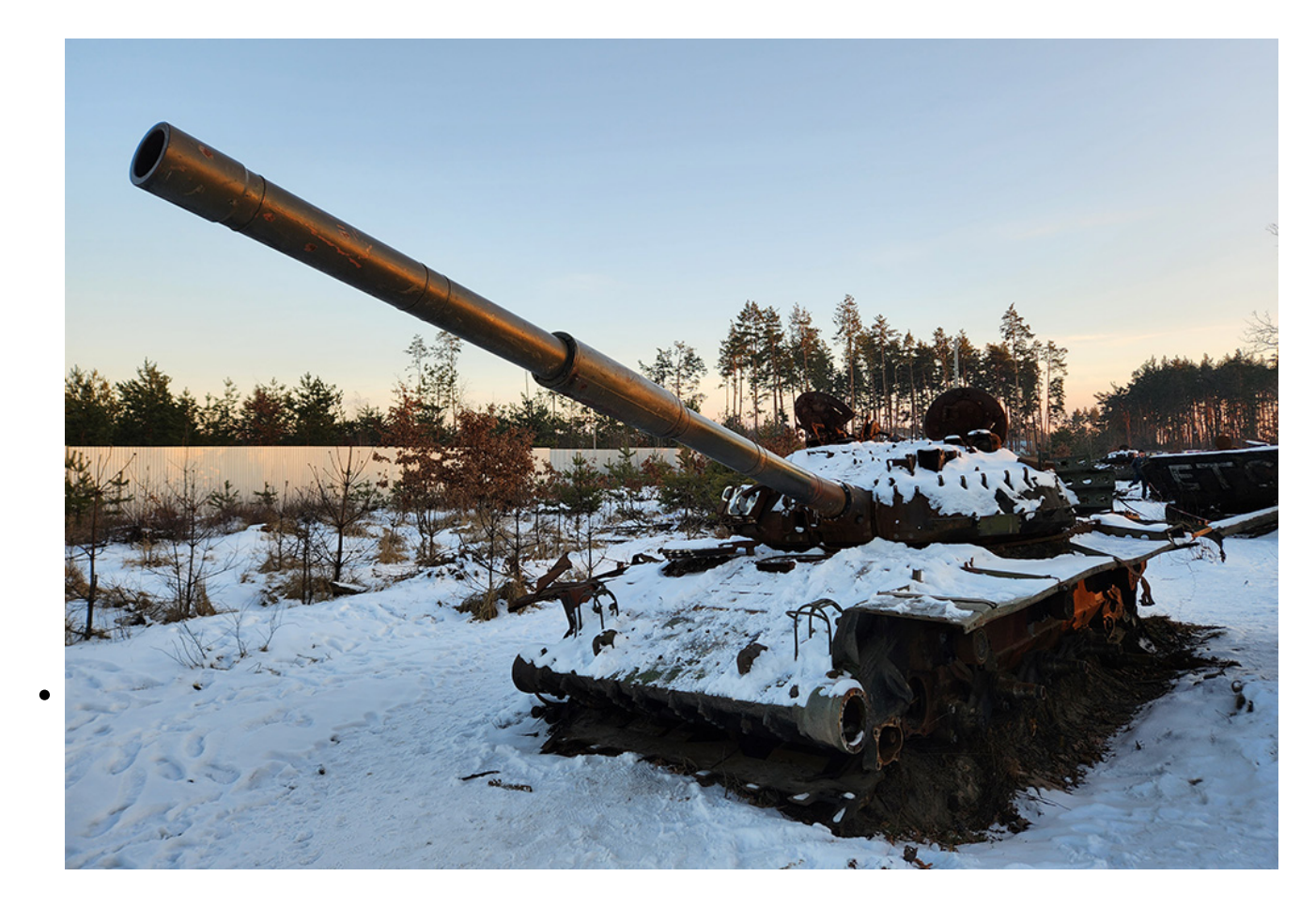
An abandoned Russian tank just off a highway near the Ukrainian capital of Kyiv