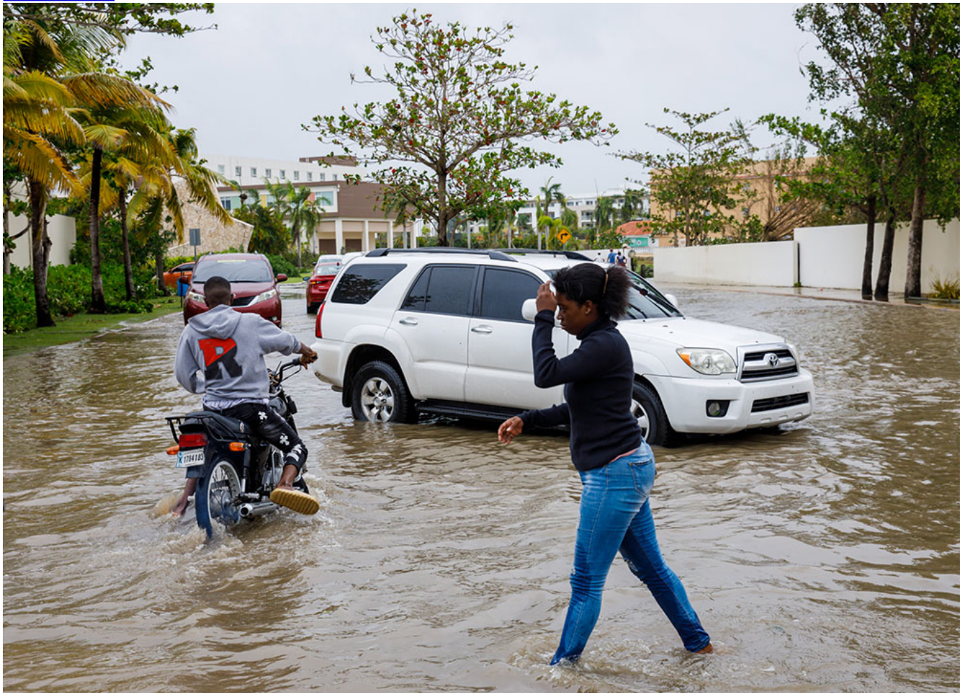
A flooded street is seen Sept. 19, 2022, in Bávaro, Punta Cana, Dominican Republic, in the aftermath of Hurricane Fiona.