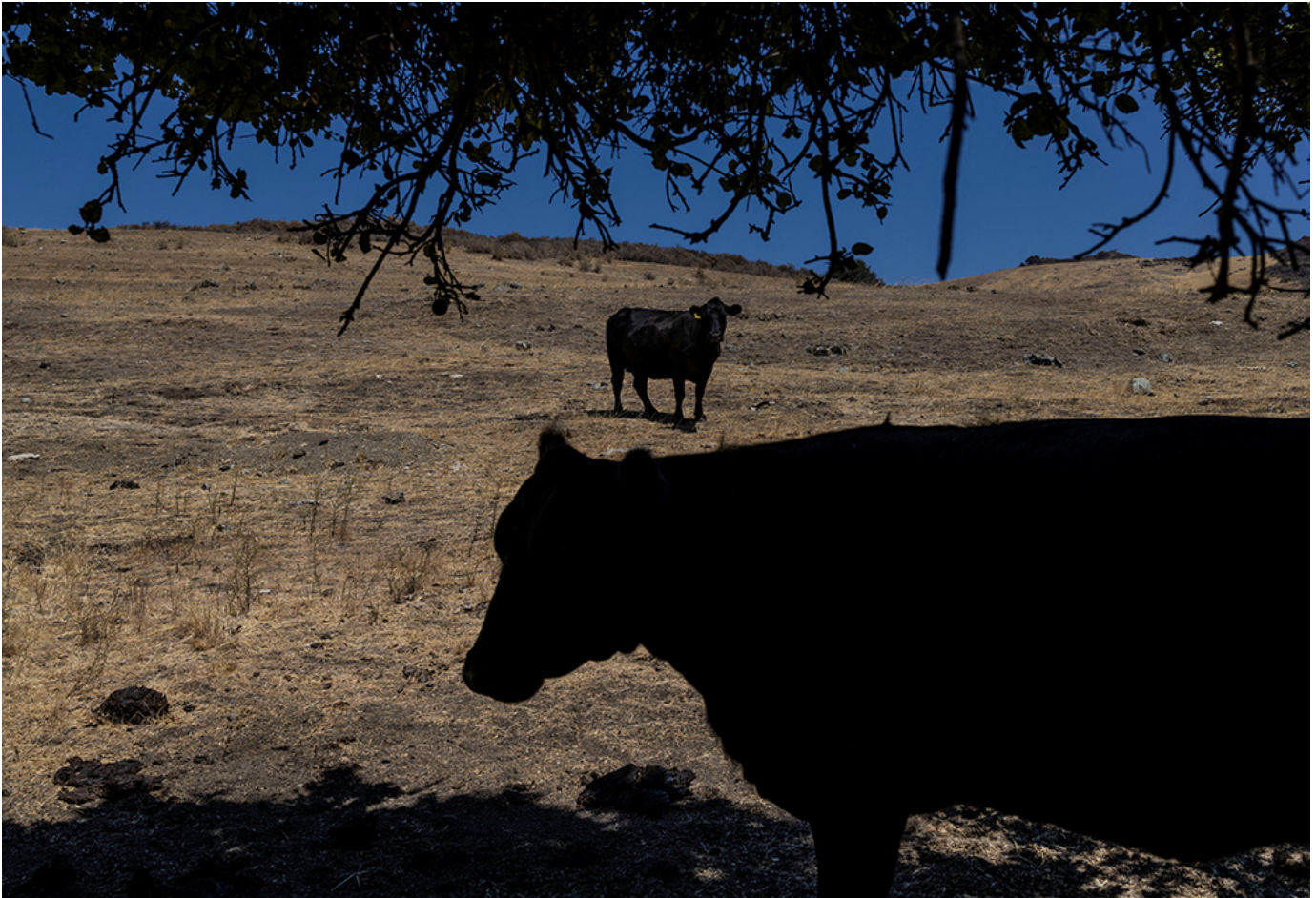
Livestock is seen in a dry field Aug. 15, 2022, near Sacramento, California.