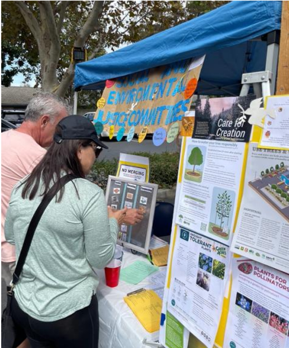
Parishioners stop at the social and environmental justice committee's activity booth at the St. Anthony Parish Fall Festival Sept. 17, 2022, in Sacramento.

Along with frustrations, the parishioners outlined several steps for the diocese to take. In addition to a diocesan creation care committee, they asked the diocese to host events and speakers on faith and ecology, and for it to provide spaces to gather and discuss how to start creation care teams in their parishes.