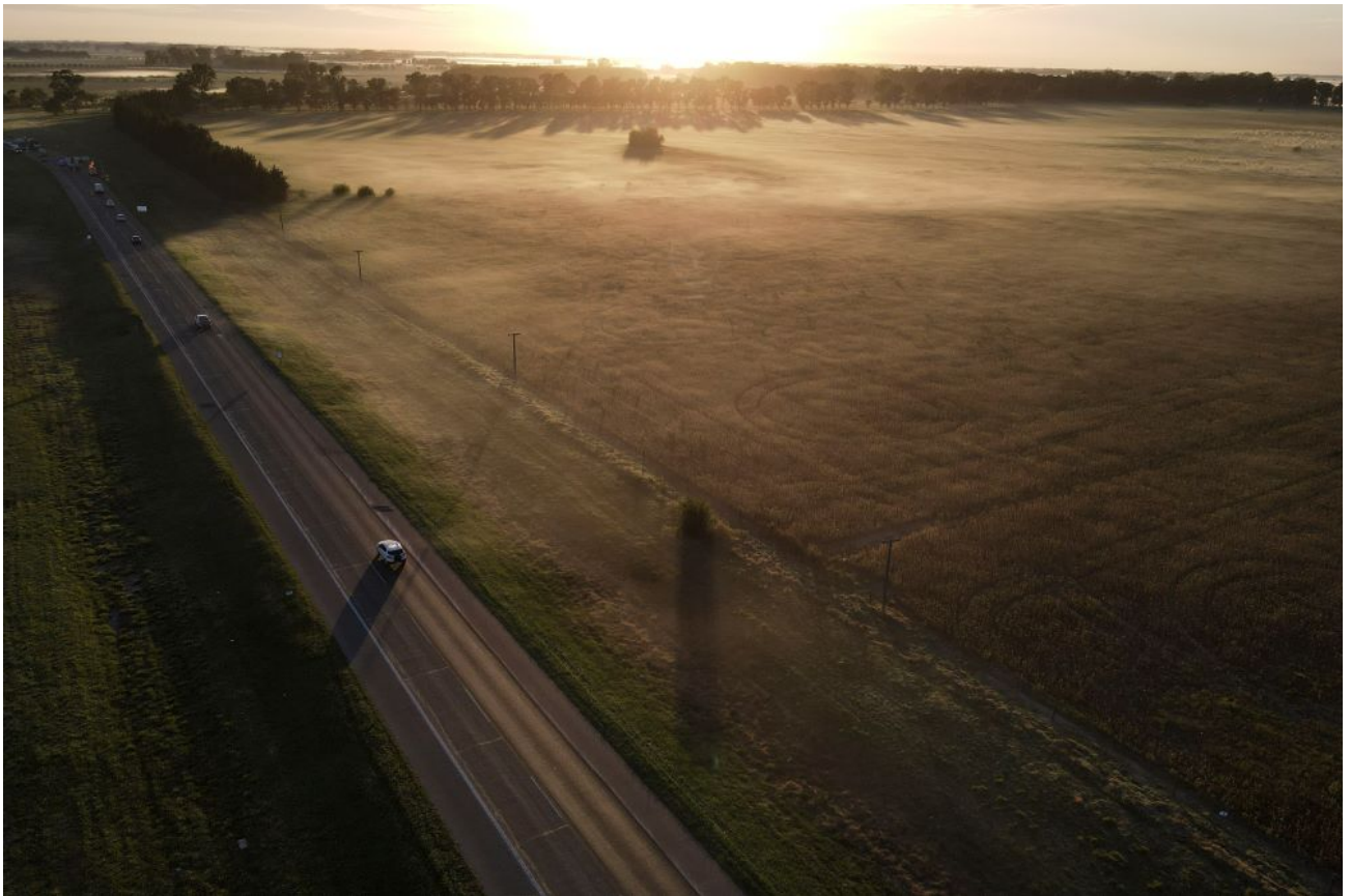
A car drives down a road near farmland in Lobos, Argentina, Friday, April 14, 2023. Huge amount of the harvest of soybean and corn has been lost in Argentina due to drought.