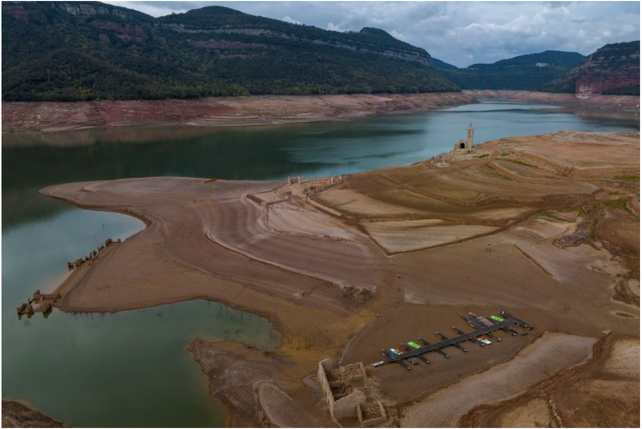
Dry, cracked land is visible around at the Sau reservoir, about 100 km (62 miles) north of Barcelona, Spain, Tuesday, April 18, 2023.