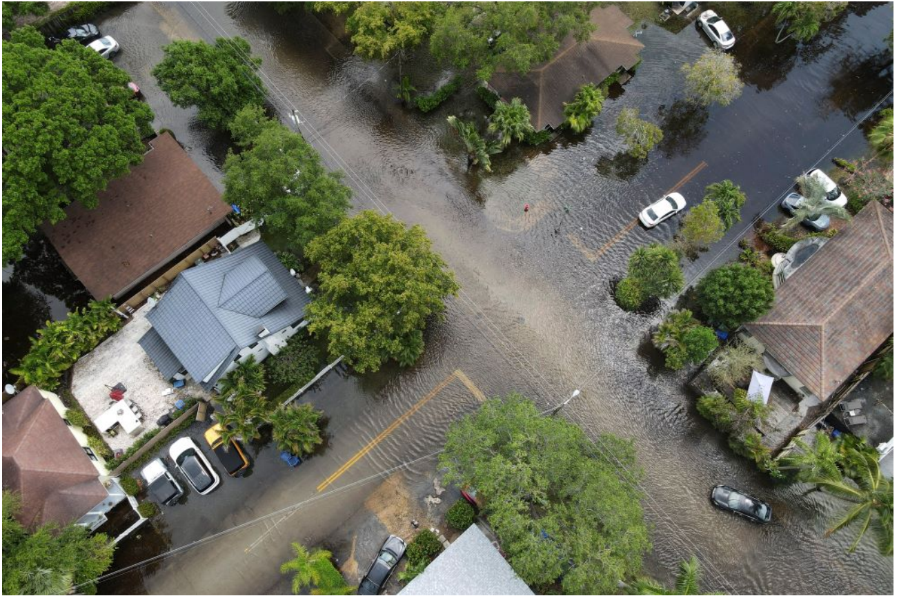
A pair of waterlogged cars sit abandoned in the road as floodwaters recede in the Sailboat Bend neighborhood of Fort Lauderdale, Fla., Thursday, April 13, 2023.