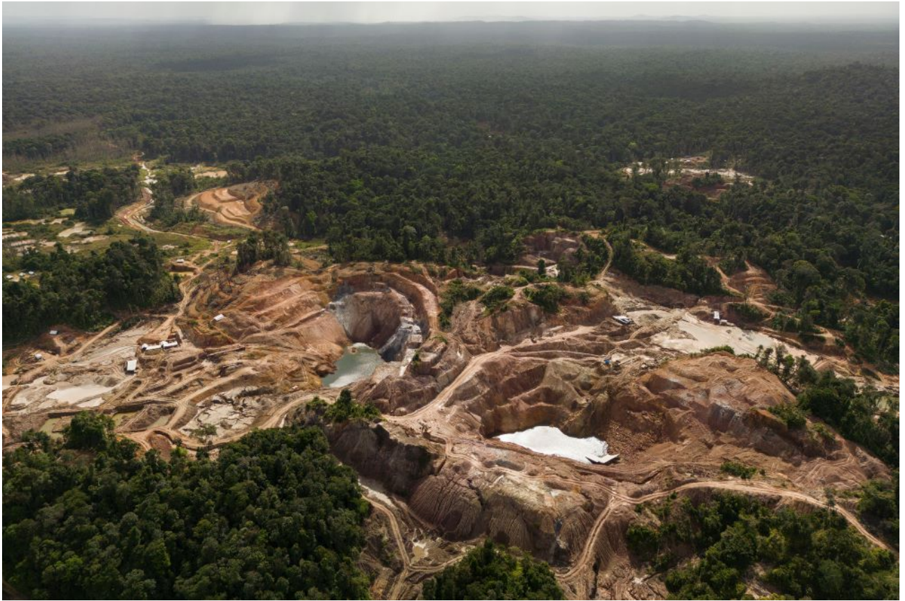
The Tassawini Gold Mines are visible amid trees in Chinese Landing, Guyana, Monday, April 17, 2023.