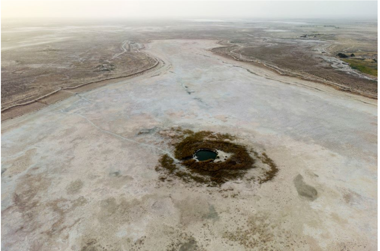
A dried Sawa Lake is surrounded by a dry bed in Iraq, Monday, April 10, 2023.