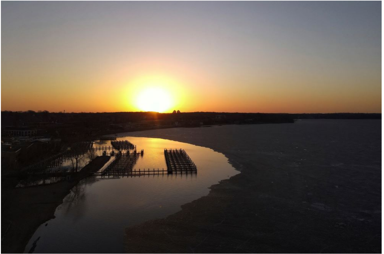
Boat docks are visible where ice has thawed at Wayzata Bay in Lake Minnetonka, Thursday, April 13, 2023, in Wayzata, Minn.