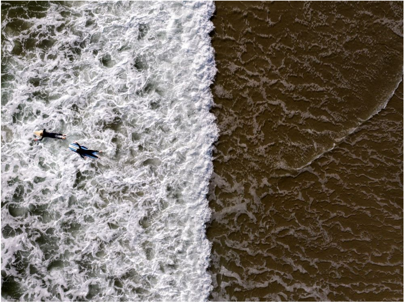
Two surfers waded through water in Huntington Beach, Calif., Monday, April 17, 2023.