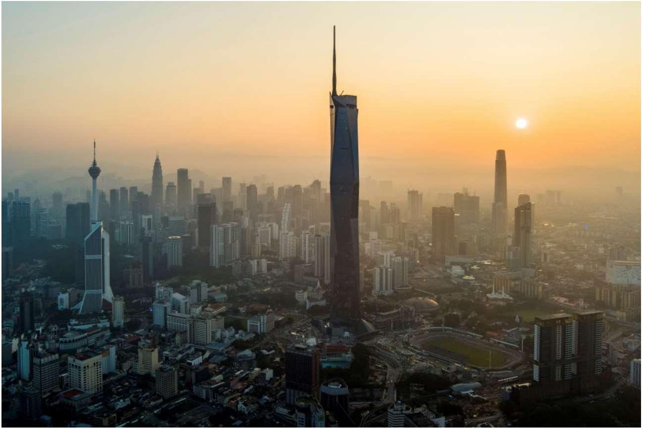
The sun rises over downtown Kuala Lumpur, Malaysia on April 11, 2023.