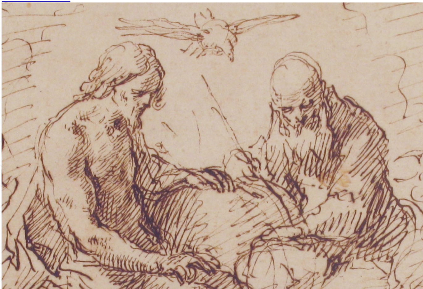
"The Holy Trinity in Glory" (detail), a 17th-century ink drawing by Italian artist Simone Cantarini (Metropolitan Museum of Art)