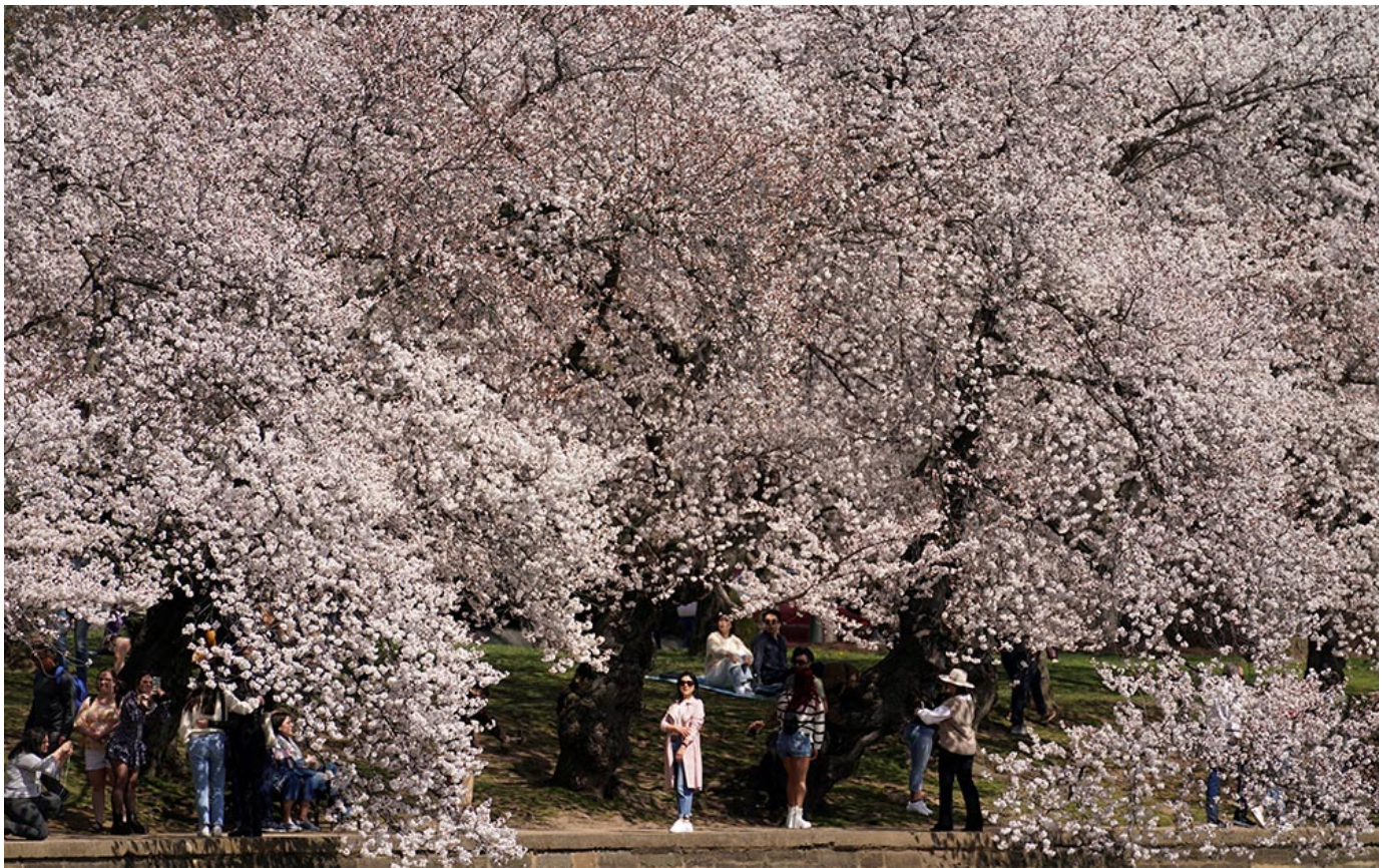
People in Washington are seen under a canopy of cherry blossoms in peak bloom March 21, 2022.

The nation's capital has a deep-rooted history with trees. Tourists and locals flock each spring to the Tidal Basin for the annual Cherry Blossom Festival, and as far back as the 1800s, Washington, D.C., garnered the nickname "the City of Trees" for the thousands that lined its streets. As of 1950, tree canopy covered half of the district's map.