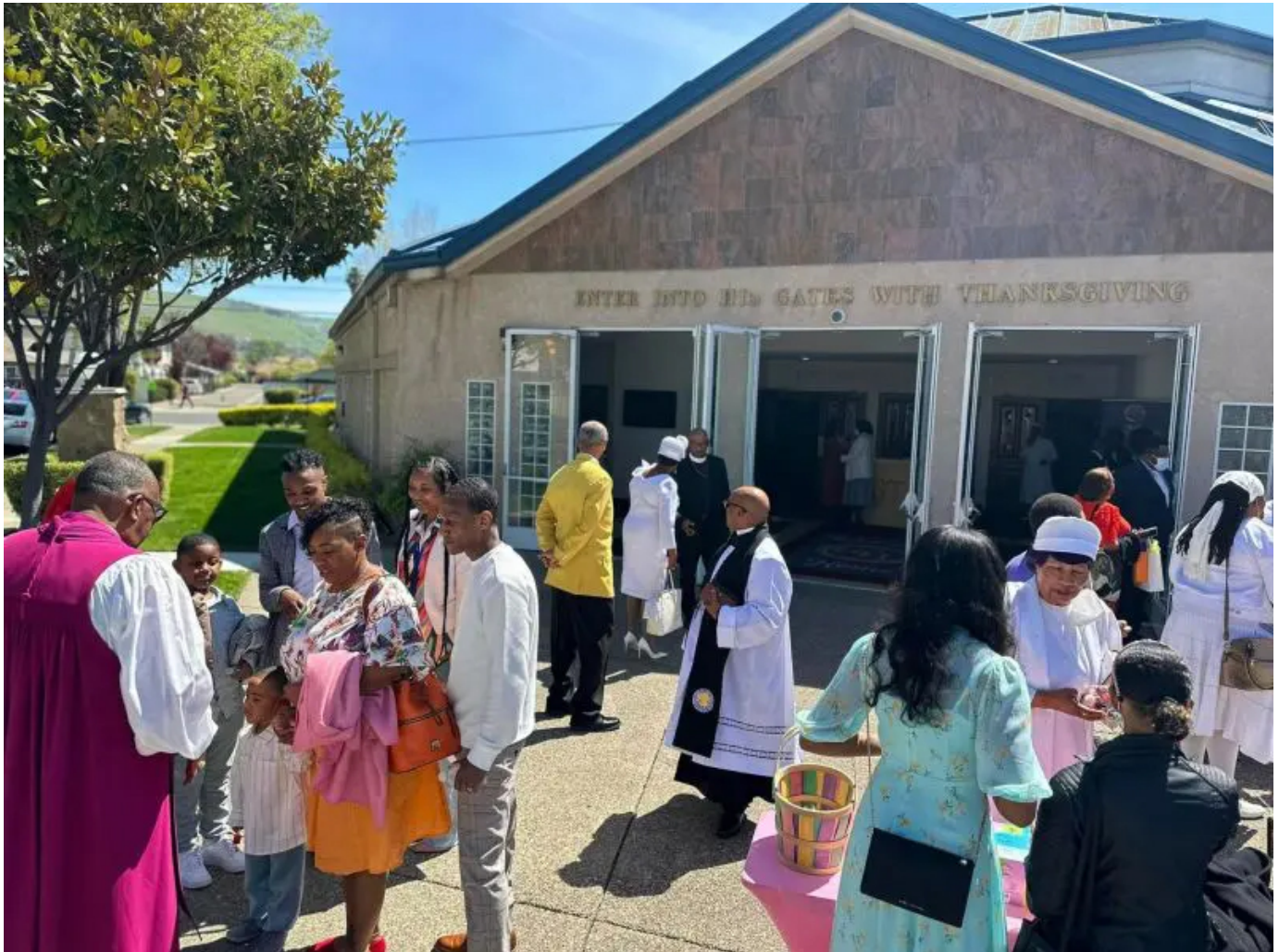
Glad Tidings International Church, April 2023