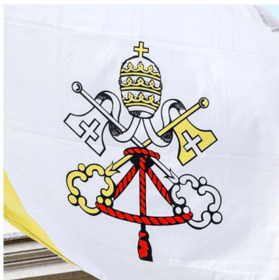
Vatican City flag at the Jesuit headquarters