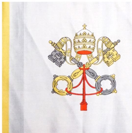
Vatican City flag at a souvenir shop