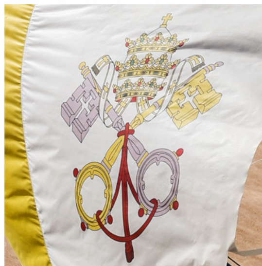
Vatican City flag at a Vatican-owned building

A variety of versions of the Vatican City flag are seen around Rome. Clockwise from the upper left, this graphic features the official version published in 2000 and again May 13, 2023; a version sold in a souvenir shop near the Vatican; the flag flying on the Jesuit headquarters; and the flag flying on a Vatican office building on Via della Conciliazione. Some of the images have been rotated to make comparisons easier.