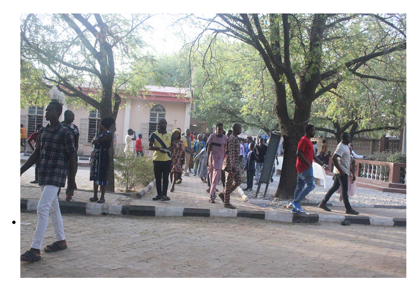
Parishioners exit the church after 6 a.m. Mass on March 5.

Ransoms <u>paid</u> to the militants by the government and families of victims, is worth millions of dollars each year.