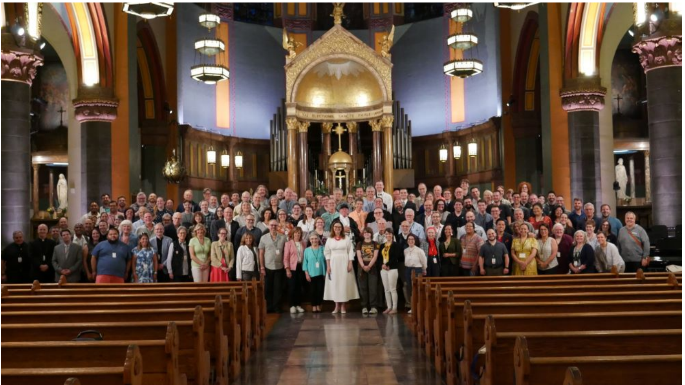
A group photo of attendees of the June 16-18 Outreach conference, held at Fordham University.