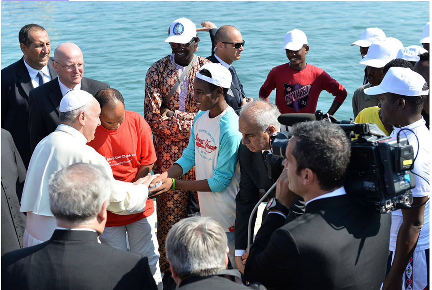
Pope Francis greets immigrants as he arrives at the port in Lampedusa, Italy, July 8, 2013.