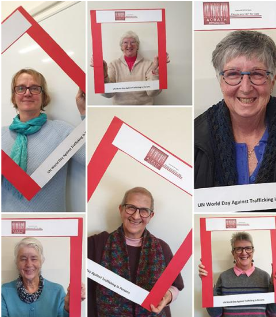
Victorian members of Australian Catholic Religious Against Trafficking in Humans, showing their support for the U.N. World Day Against Trafficking in Persons in 2021

In Australia, Good Shepherd Sisters don't work directly with people who are trafficked; we are members of Australian Catholic Religious Against Trafficking in Humans, or ACRATH , which assists in education, advocacy and support and works with other NGOs and state and federal governments to address the issue. Recently, advocacy over 17 years bore fruit for a group of workers from Vanuatu who received wages that had been kept from them. In May 2023, the Australian government allocated funds so victims and survivors of human trafficking can access support without involving law enforcement. A momentous achievement! This gives families safety and protects their immigration status. Their stories have informed advocacy