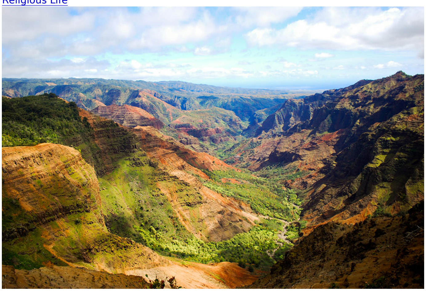
Waimea Canyon on the island of Kauai, Hawaii