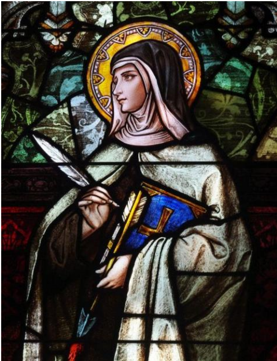
St. Teresa of Avila